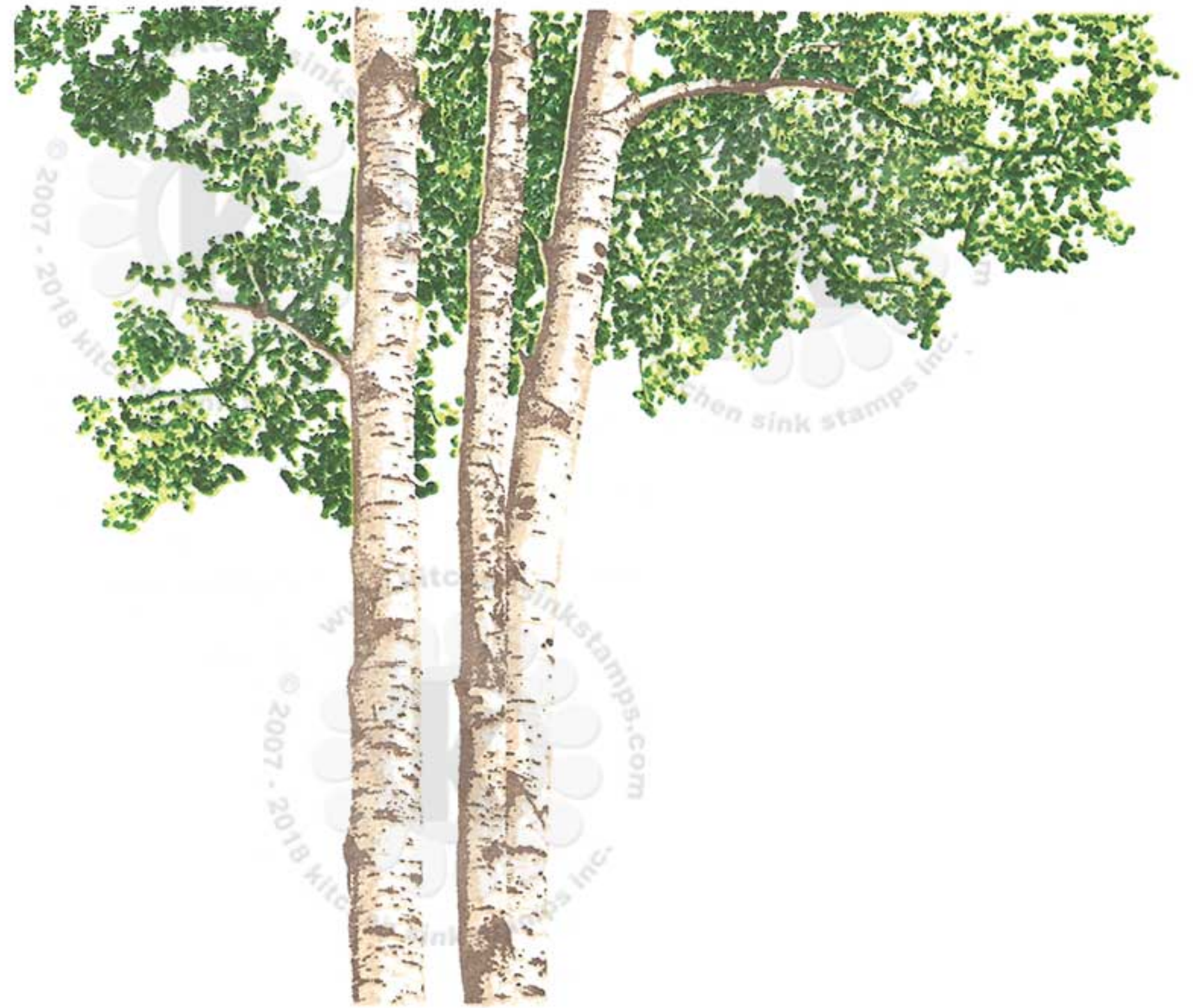
Step #3 (leaves) - Pear Tart