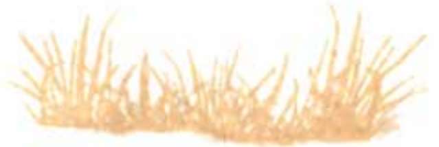
Step #2 - Desert Sand Step #1 - Cantaloupe