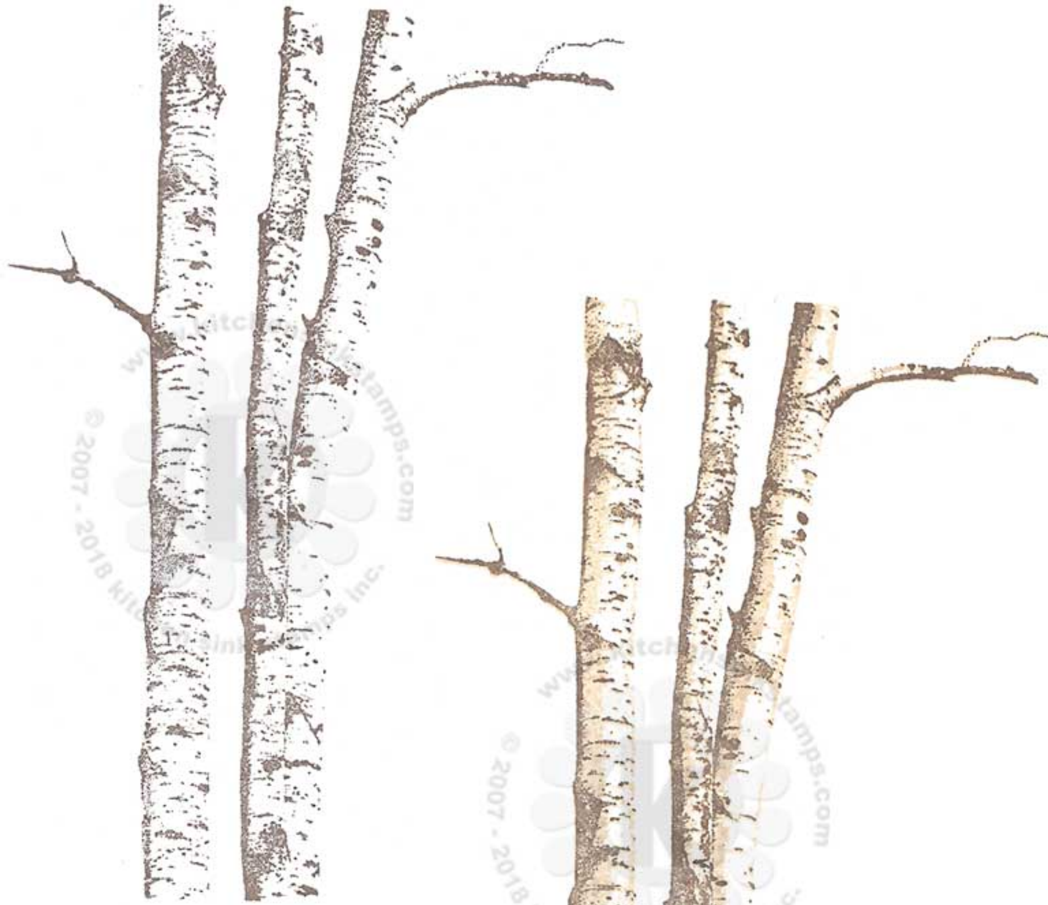
Step #2 (tree trunk) - Rich Cocoa

suggested stamping order for easier stamp alignment