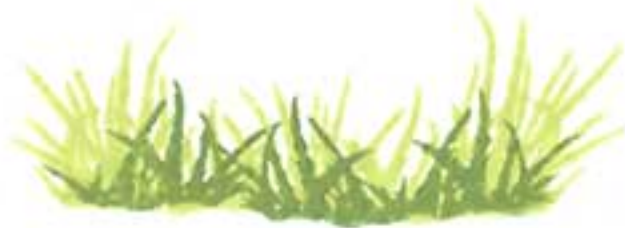
Step #2 - Bamboo Leaves Step #1 - Pear Tart