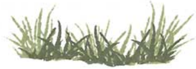
Step #2 - Olive Grove Step #1 - Pistachio

suggested stamping order for easier stamp alignment