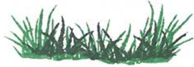
Step #2 - Northern Pine Step #1 - Cottage Ivy