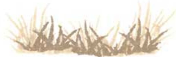
Step #2 - Toffee Crunch Step #1 - Desert Sand