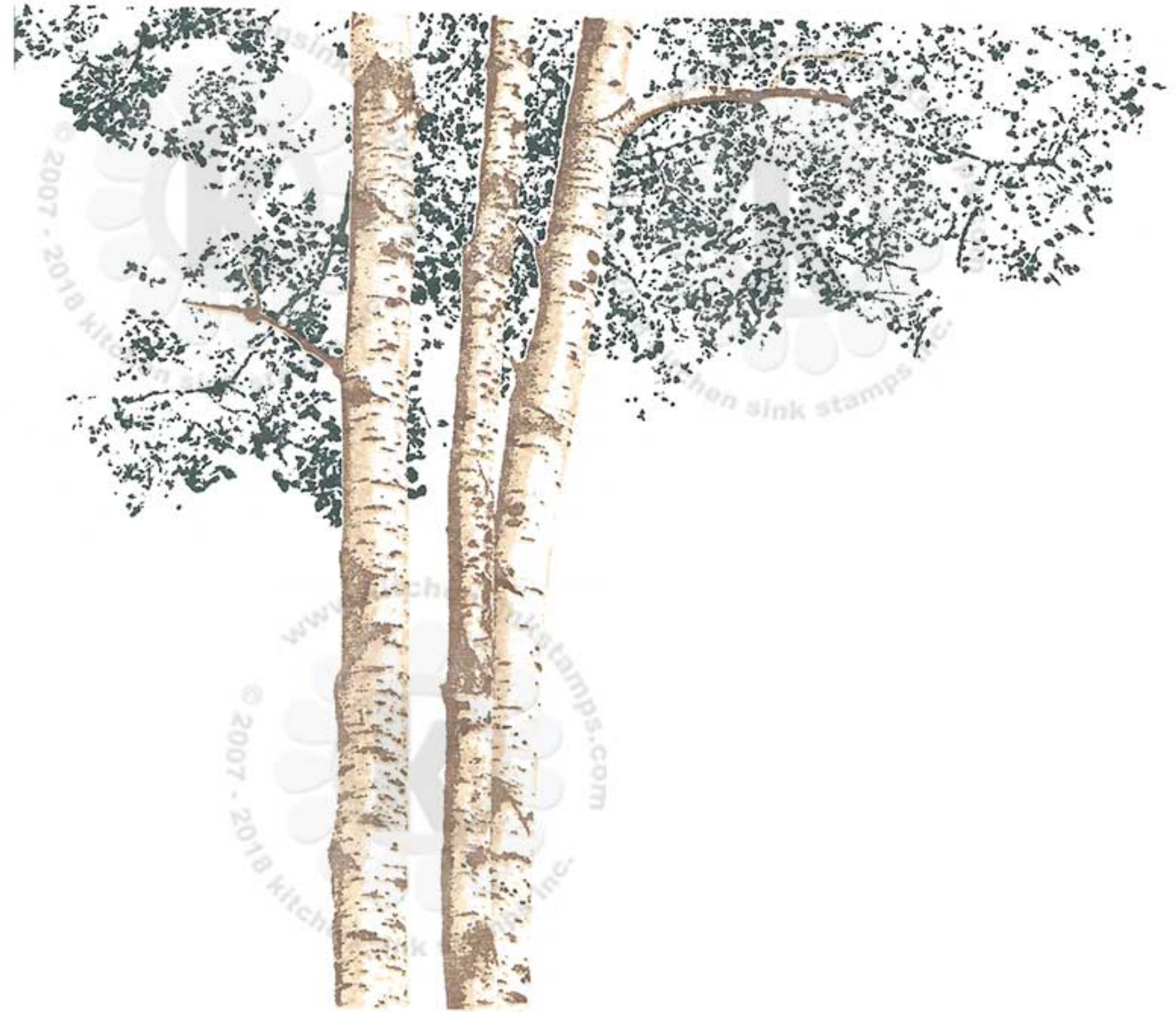
Step #3 (leaves) - Northern Pine