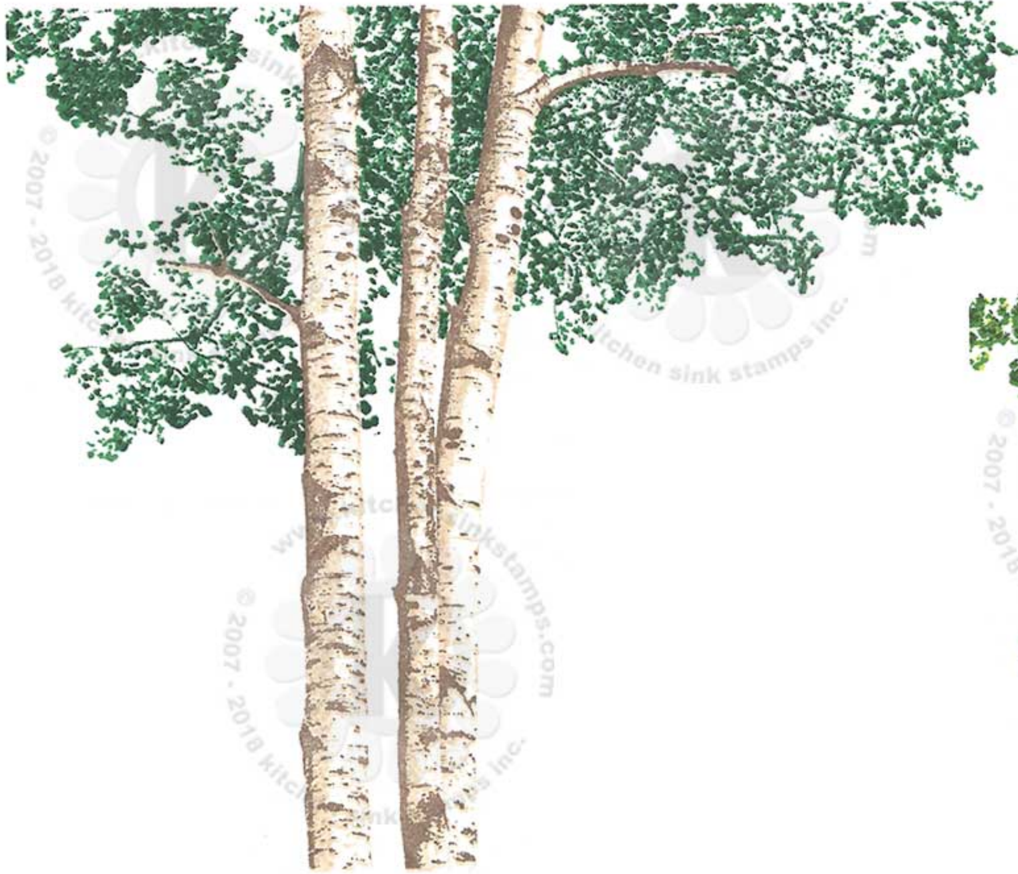
Step #2 (leaves) - Cottage Ivy

suggested stamping order for easier stamp alignment