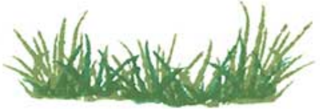
Step #2 - Cottage Ivy Step #1 - Bamboo Leaves