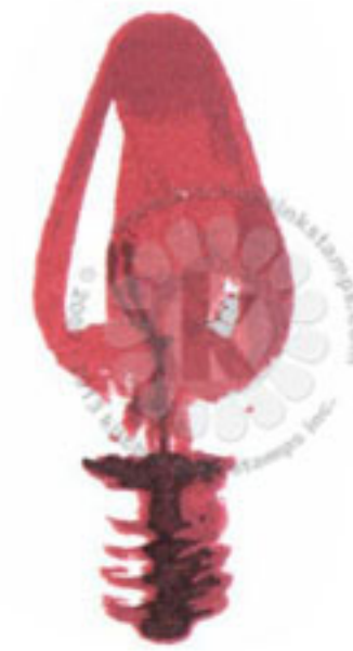
Step #3 Rhubarb Stalk - stamp 2x's Memento Ink