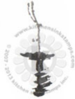
Step #5 Smokey Gray then on the bottom half Onyx Black VersaFine Ink