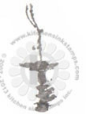
Step #5 Smokey Gray VersaFine Ink