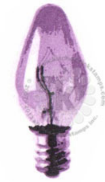
Step #1 Lulu Lavender Memento Ink