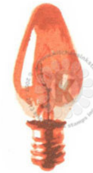
Step #2 Tangelo - stamp off 1x Repeat Memento Ink