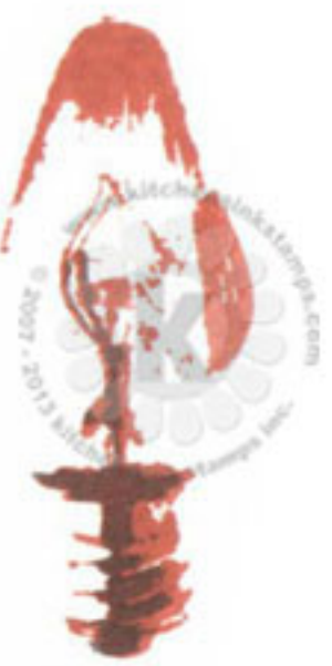
Step #4 Potter's Clay Memento Ink