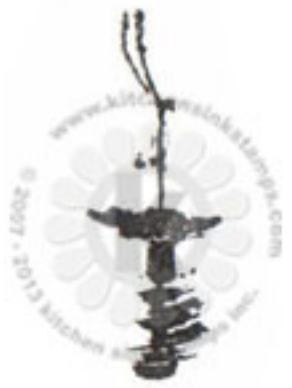
Step #5 Onyx Black VersaFine Ink