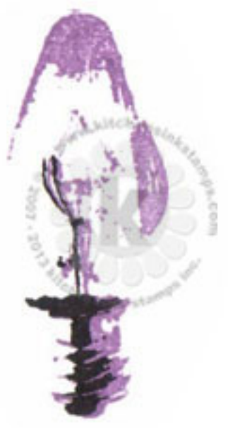
Step #4 Grape Jelly Memento Ink