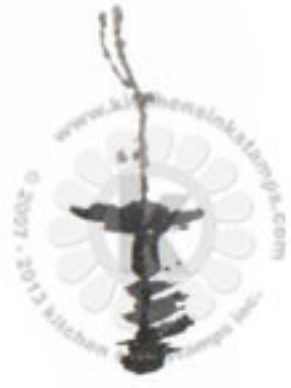
Step #5 Smokey Gray then on the bottom half Onyx Black VersaFine Ink