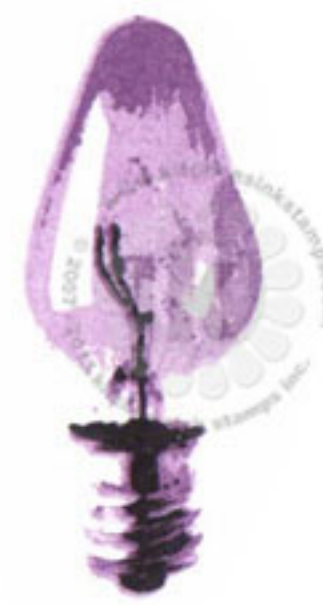
Step #3 Grape Jelly - stamp off 1x Repeat Memento Ink