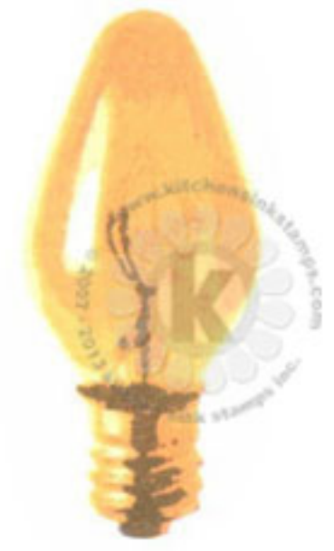
Step #1 Dandelion - stamp off 1x Repeat 2x's