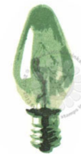
Step #2 Bamboo Leaves Memento Ink