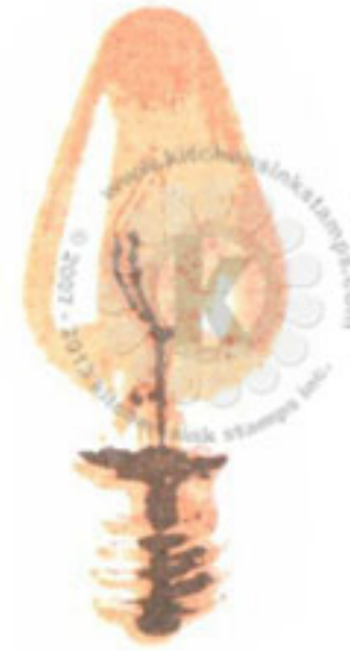
Step #3 Cantaloupe Memento Ink