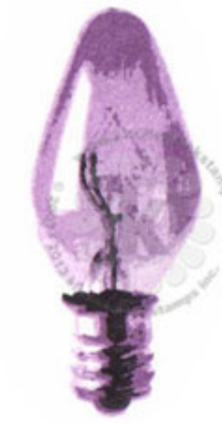
Step #2 Grape Jelly - stamp off 1x Memento Ink