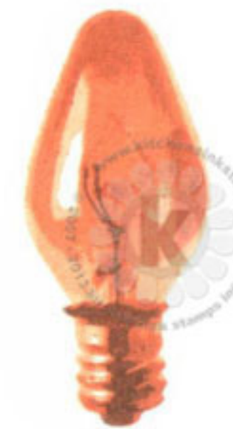
Step #1 Cantaloupe Memento Ink