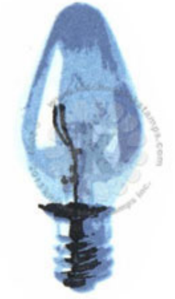
Step #1 Sky Blue - stamp 2x's Memento Ink