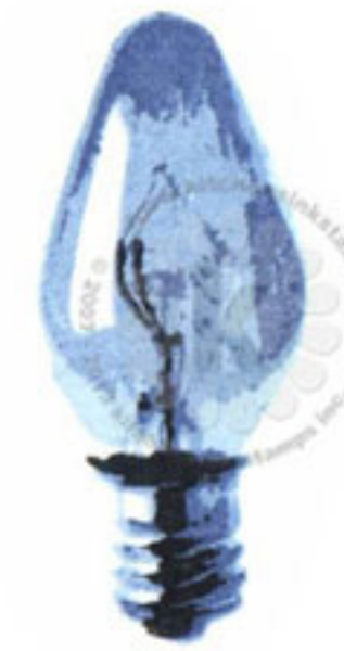
Step #2 Danube Blue - stamp off 1x Memento Ink