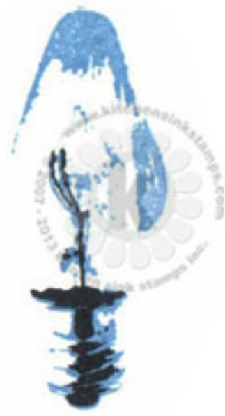
Step #4 Danube Blue Memento Ink