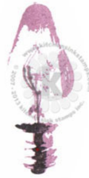
Step #4 Sweet Plum Memento Ink