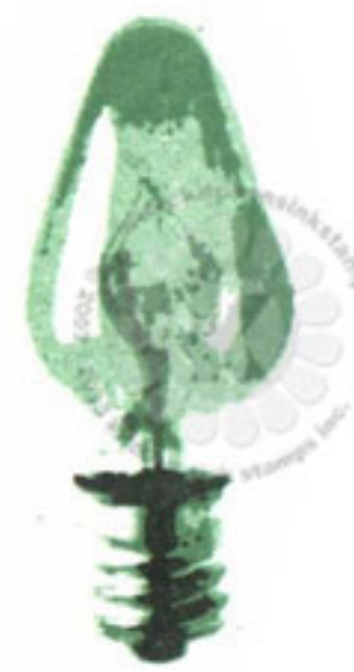
Step #3 Cottage Ivy - stamp off 1x Repeat Memento Ink