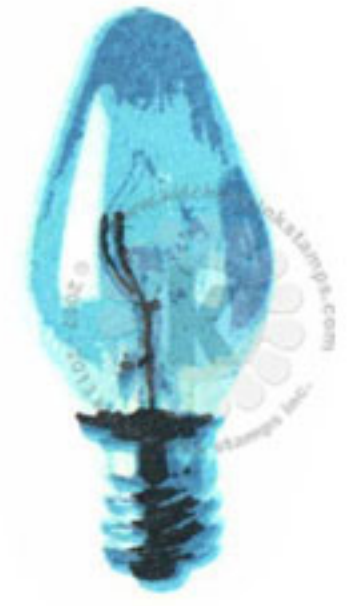
Step #1 Sky Blue - stamp 2x's Memento Ink