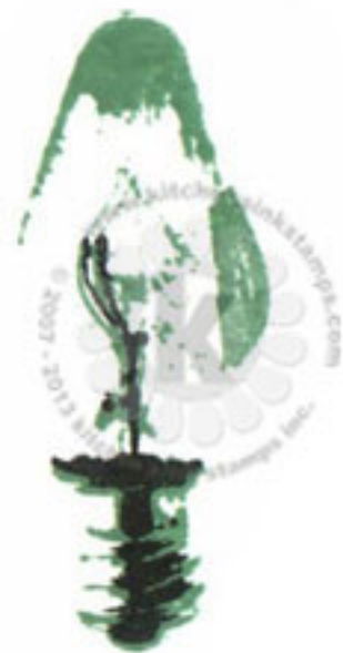
Step #4 Cottage Ivy Memento Ink