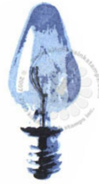
Step #3 Paris Dusk - stamp off 1x then Danube Blue - stamp off 1x Memento Ink