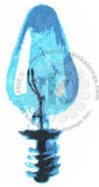
Step #3 Bahama Blue Memento Ink