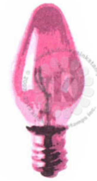
Step #1 Lilac Posies - stamp off 1x Memento Ink