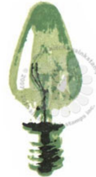
Step #3 Bamboo Leaves - 2x's Memento Ink