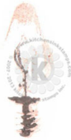
Step #4 Potter's Clay - stmp off 1x Memento Ink