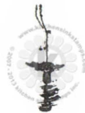
Step #5 Onyx Black VersaFine Ink