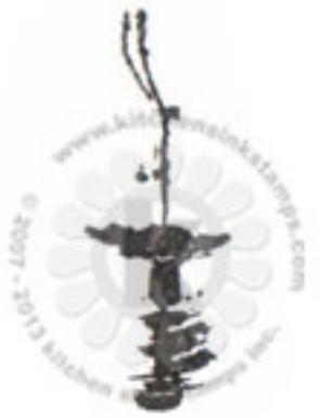
Step #5 Onyx Black VersaFine Ink