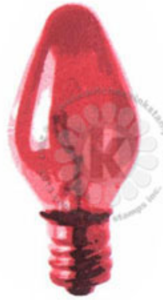
Step #1 Lady Bug - stamp off 1x Memento Ink