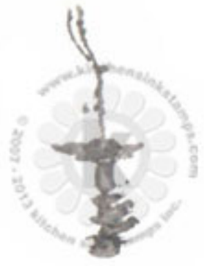
Step #5 Smokey Gray VersaFine Ink