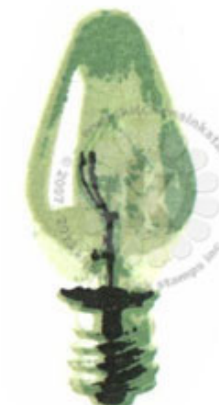
Step #2 New Sprout - 2x's Memento Ink