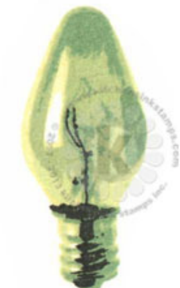
Step #1 Pear Tart Memento Ink