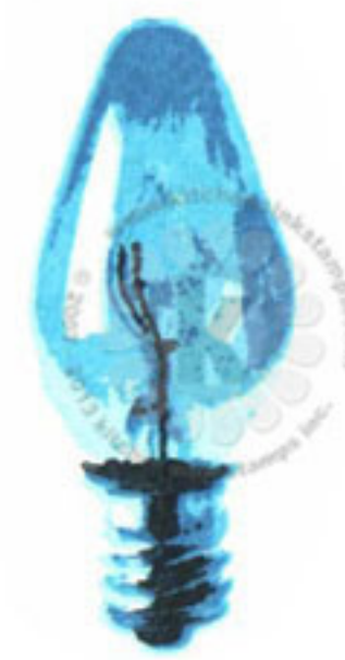
Step #2 Bahama Blue - stmp off 1x Memento Ink