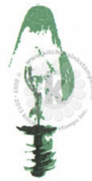
Step #4 Cottage Ivy Memento Ink