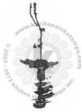
Step #5 Onyx Black VersaFine Ink