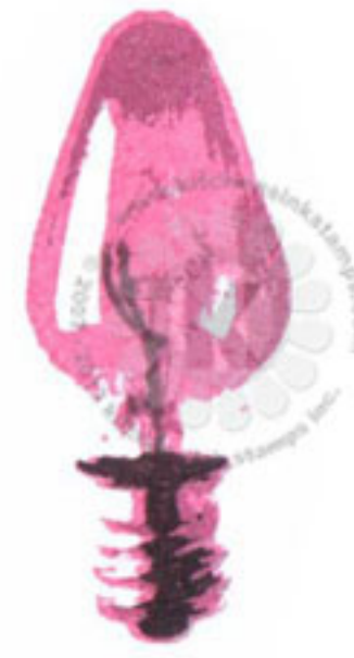
Step #3 Lilac Posies Memento Ink