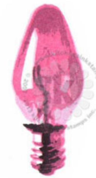
Step #2 Lilac Posies - stamp off 1x Repeat Memento Ink