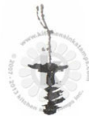
Step #5 Smokey Gray then on the bottom half Onyx Black VersaFine Ink