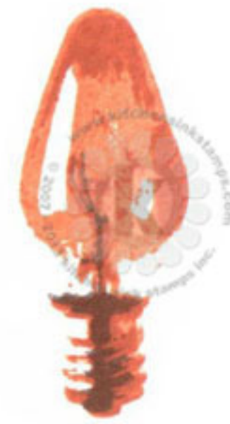
Step #3 Tangelo Memento Ink