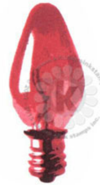
Step #2 Lady Bug Memento Ink