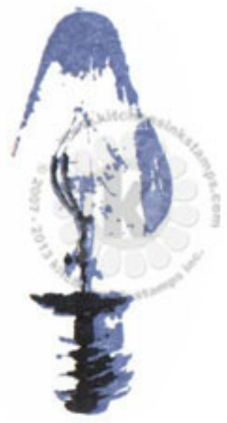
Step #4 Paris Dusk Memento Ink