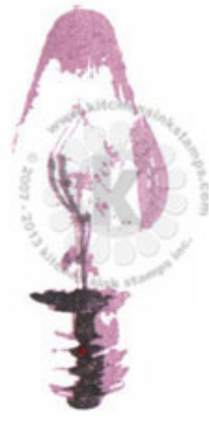
Step #4 Sweet Plum Memento Ink