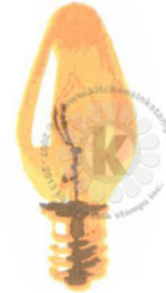
Step #2 Dandelion Memento Ink