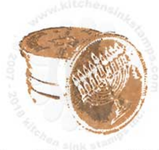
Step #3 - Peanut Brittle