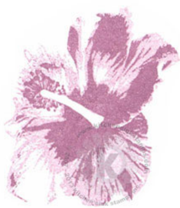
Step #2 Sweet Plum stamp off 1x Memento