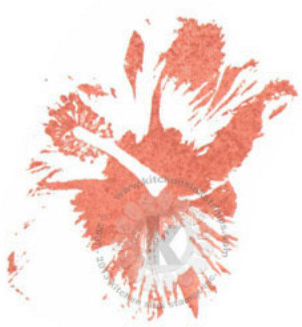
Step #3 Potter's Clay Memento