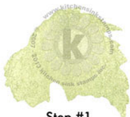
Step #1 Tea Leaves VersaMagic