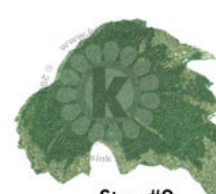
Step #2 Cottage Ivy Memento Ink