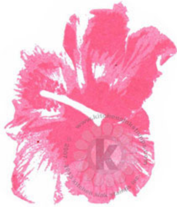
Step #2 Rose Bud Memento