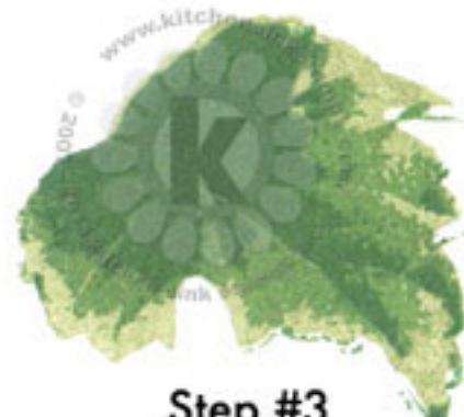
Step #3 Cottage Ivy Memento Ink