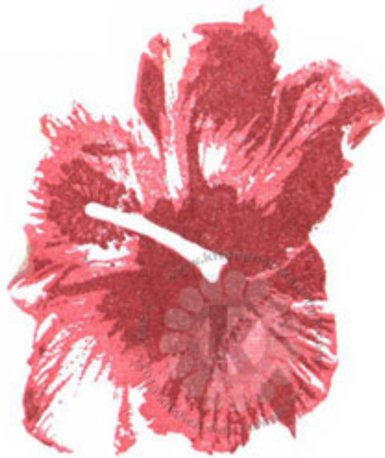
Step #2 Rhubarb Stalk Memento