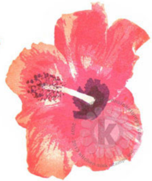
Step #5 Rich Cocoa Memento