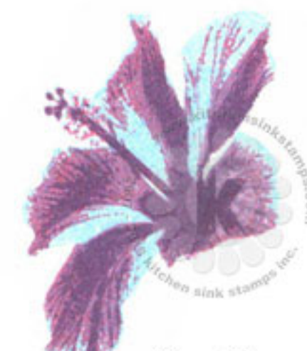
Step #1 Pearlescent Sky Blue Brilliance