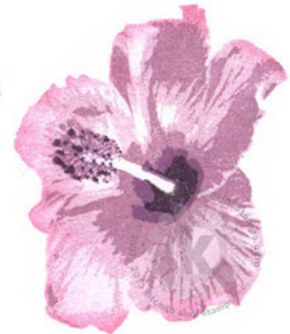
Step #5 Imperial Purple VersaFine