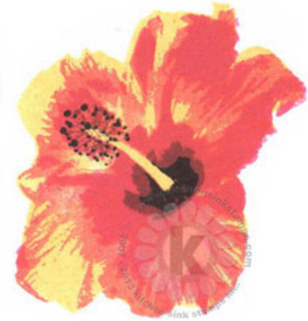
Step #5 Imperial Purple VersaFine