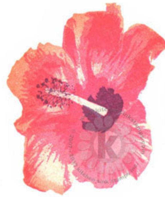
Step #4 Grape Jelly Memento