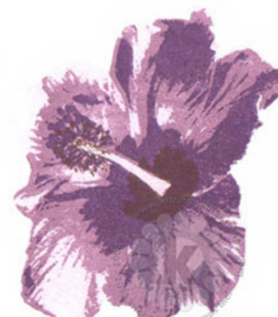
Step #4 Rich Cocoa Memento