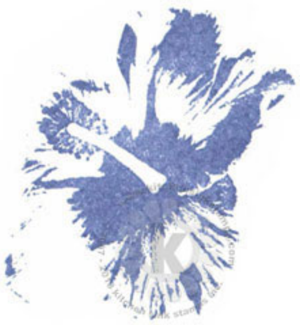
Step #3 Paris Dusk Memento