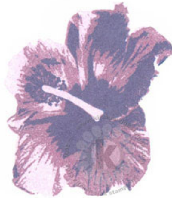
Step #1 Lulu Lavender Memento