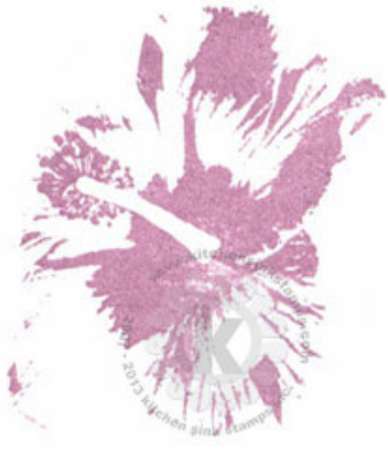
Step #3 Sweet Plum Memento