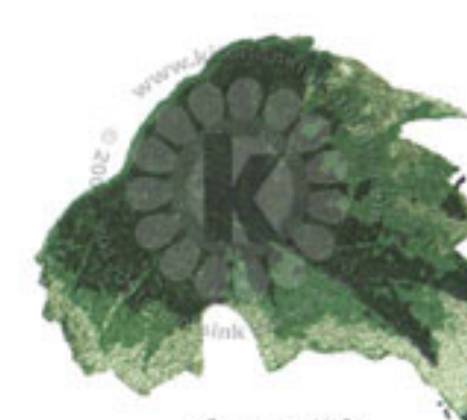
Step #3 Imperial Purple Versa Fine