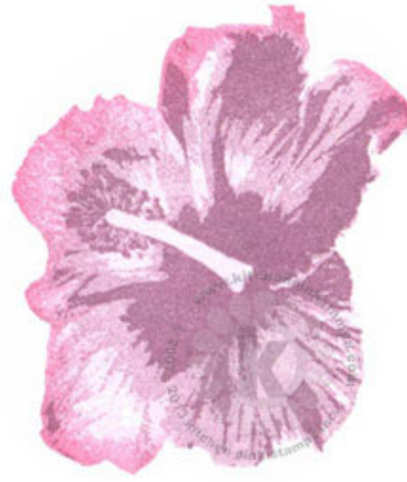
Step #3 Lulu Lavender & dab edges with Rose Bud Memento