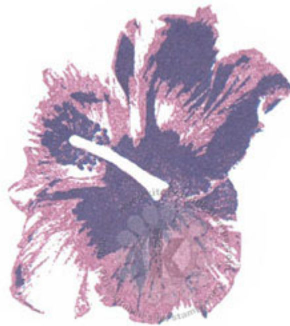
Step #2 Sweet Plum Memento