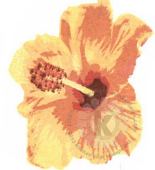
Step #5 Vintage Sepia VersaFine