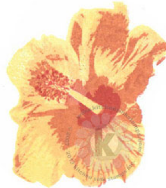
Step #4 Rhubarb Stalk Memento