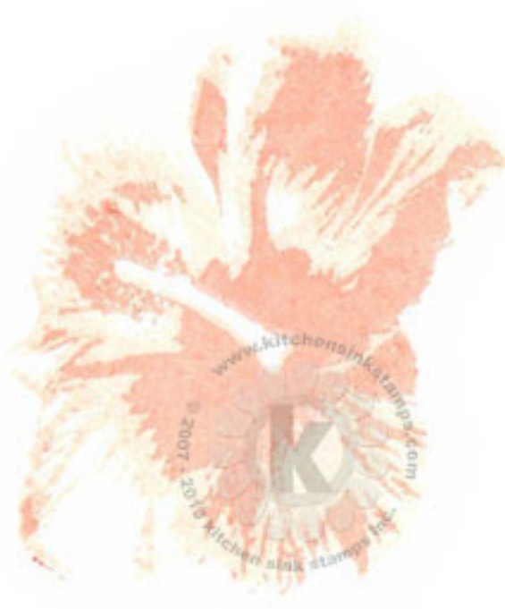
Step #2 Desert Sand Memento