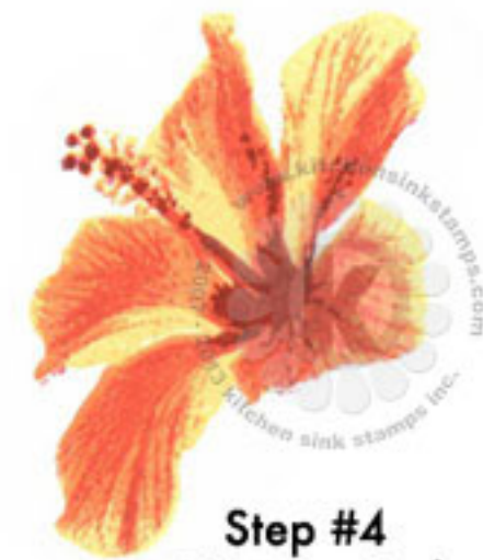
Step #4 Crimson Red VersaFine