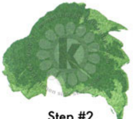
Step #2 Cottage Ivy Memento Ink