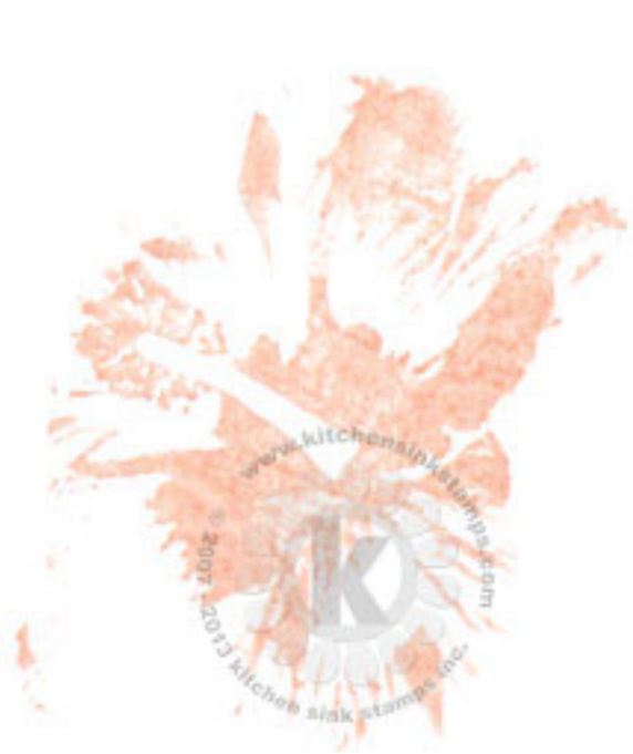
Step #3 Potter's Clay stamp off 1x Memento