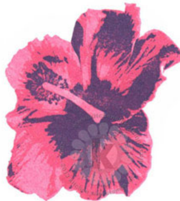
Step #3 Paris Dusk Memento