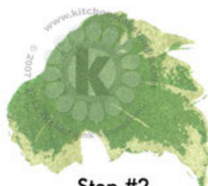
Step #2 Pearlescent Thyme Brilliance