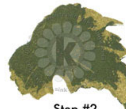
Step #2 Olympia Green Versa Fine