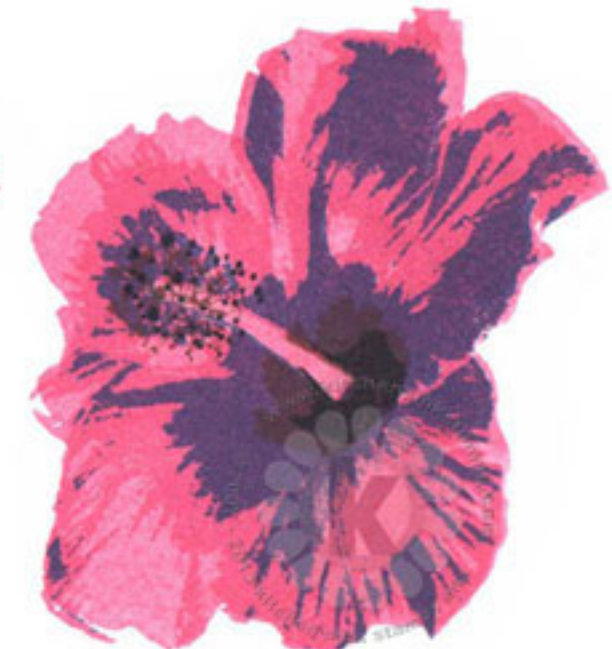
Step #5 Imperial Purple VersaFine