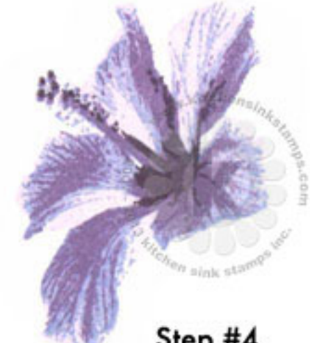
Step #4 Imperial Purple VersaFine