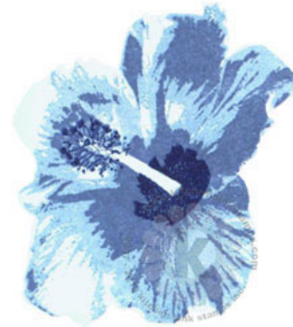
Step #4 Majestic Blue VersaFine