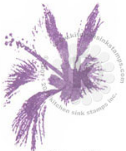
Step #3 Grape Jelly Memento