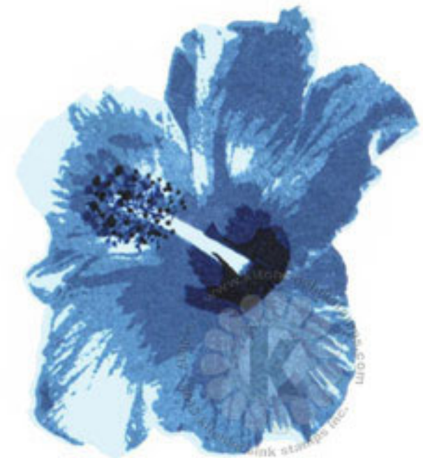
Step #5 Onyx Black VersaFine