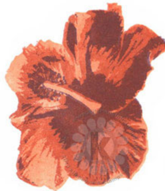
Step #3 Grape Jelly Memento