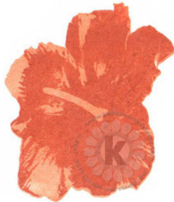
Step #2 Potter's Clay Memento