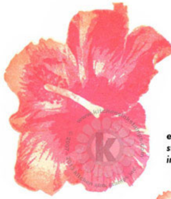
Step #1 Cantaloupe dab edges with Tangelo Memento