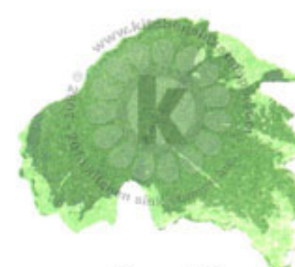
Step #2 Pearlescent Thyme Brilliance