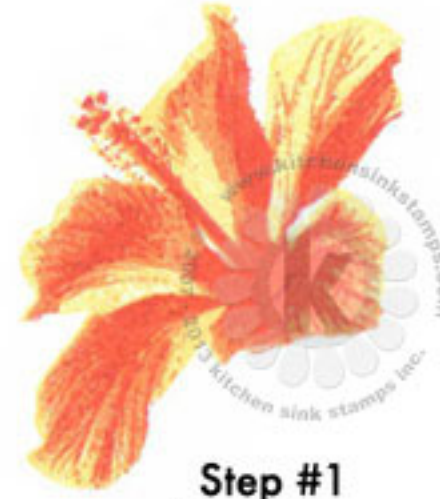
Step #1 Dandelion Memento