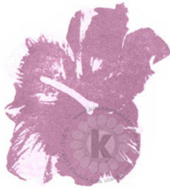
Step #2 Sweet Plum Memento