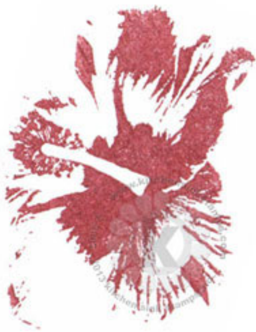
Step #3 Crimson Red VersaFine