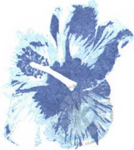
Step #2 Danube Blue stamp off 1x Memento