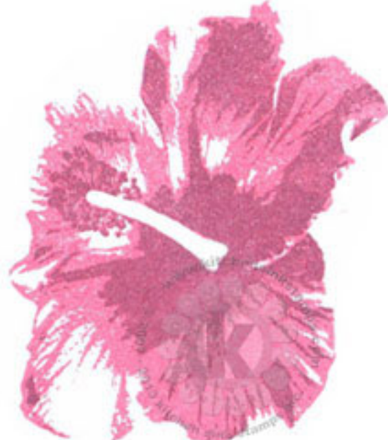
Step #2 Rose Bud Memento