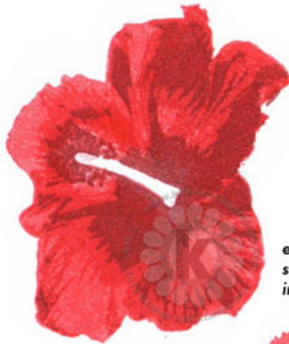
Step #1 Satin Red omit ink in center stamen VersaFine