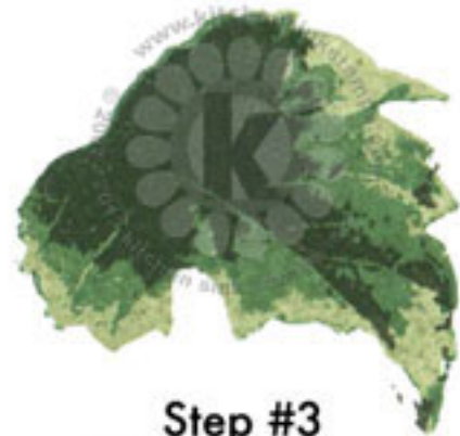
Step #3 Olympia Green Versa Fine