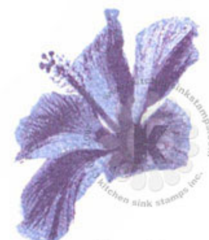
Step #1 Pearlescent Lavender Brilliance