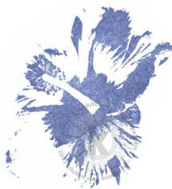
Step #3 Paris Dusk Memento