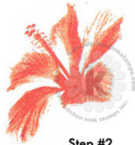
Step #2 Tangelo Memento