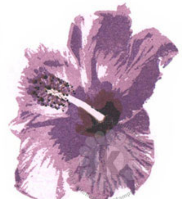
Step #5 Imperial Purple VersaFine