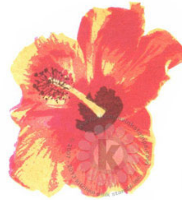
Step #4 Rich Cocoa Memento