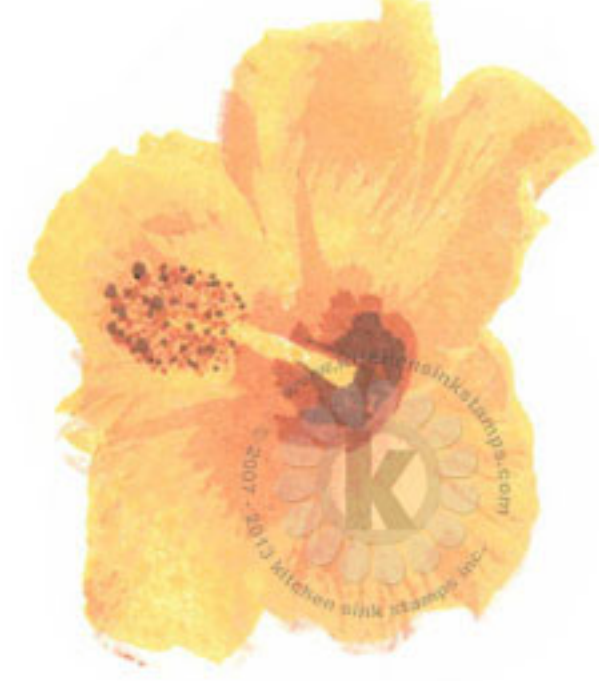
Step #5 Rich Cocoa Memento