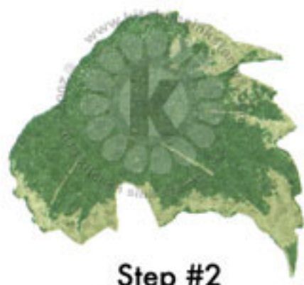
Step #2 Cottage Ivy Memento Ink