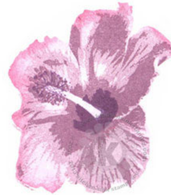
Step #4 Grape Jelly Memento