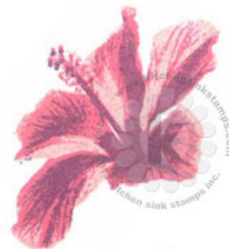
Step #1 Pink Grapefruit VersaMagic