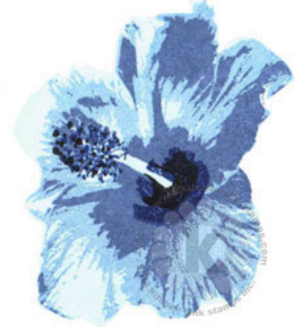
Step #5 Onyx Black VersaFine