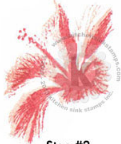
Step #2 Potter's Clay stamp off 1x Memento