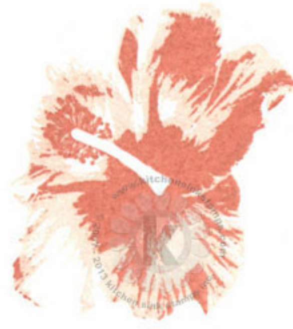
Step #2 Desert Sand Memento