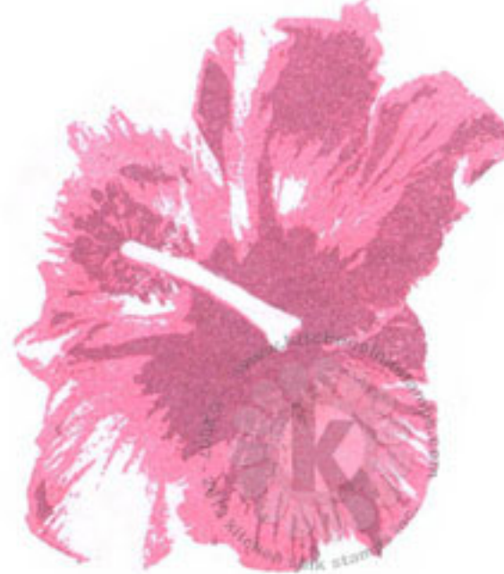
Step #3 Angel Pink stamp 2xs Memento