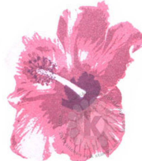
Step #4 Grape Jelly Memento