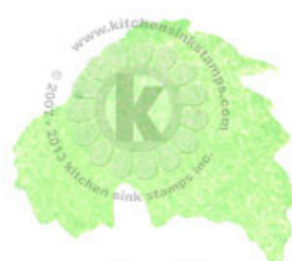
Step #1 Pearlescent Lime Brilliance