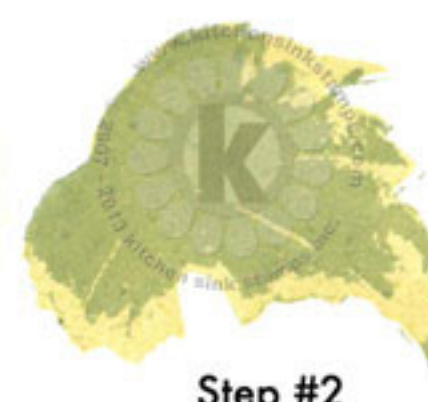
Step #2 Bamboo Leaves Memento Ink