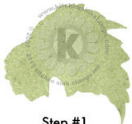
Step #1 Bamboo Leaves Memento Ink