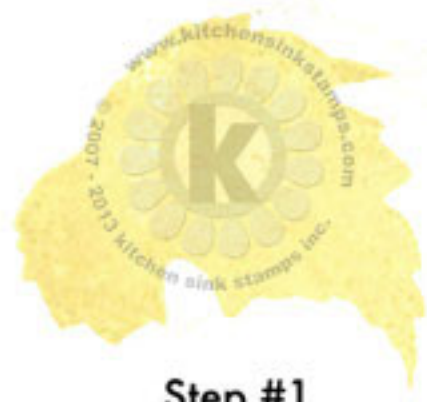
Step #1 Pear Tart Memento Ink