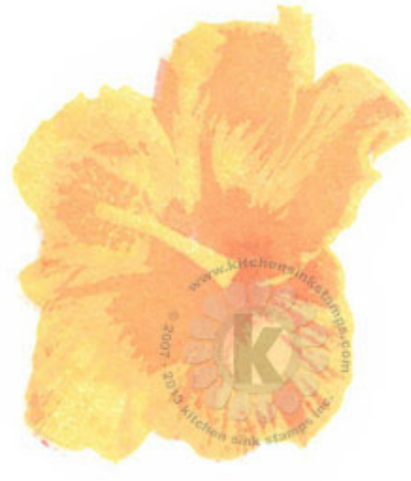
Step #1 Dandelion Memento