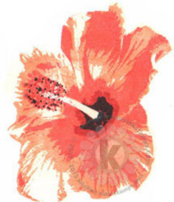
Step #5 Imperial Purple VersaFine