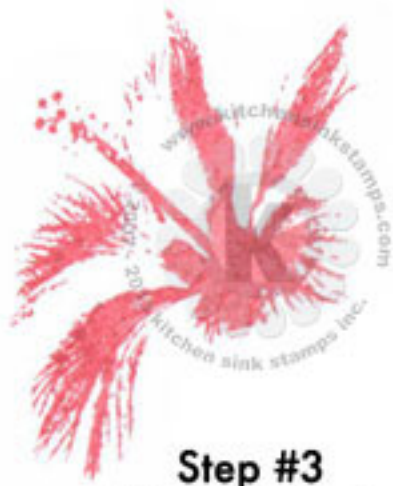
Step #3 Rhubarb Stalk Memento