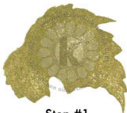
Step #1 Spanish Moss Versa Fine