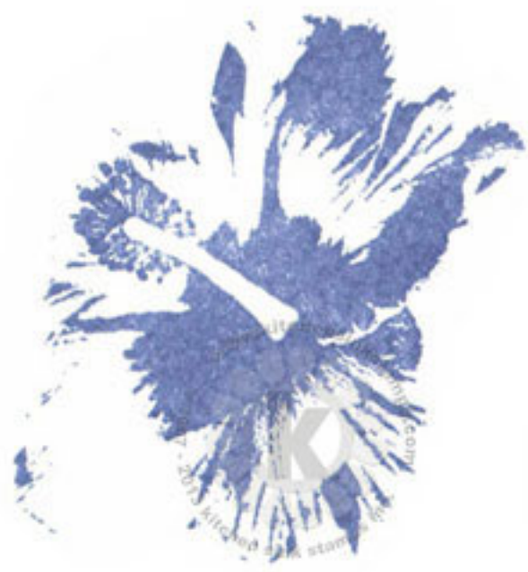
Step #3 Paris Dusk Memento