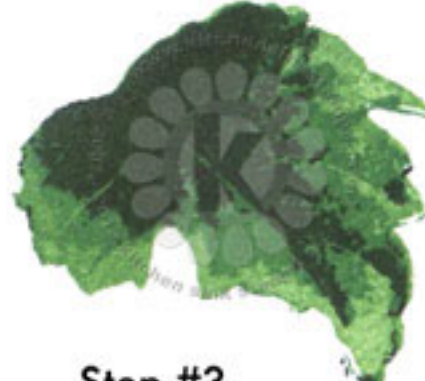
Step #3 Imperial Purple Versa Fine