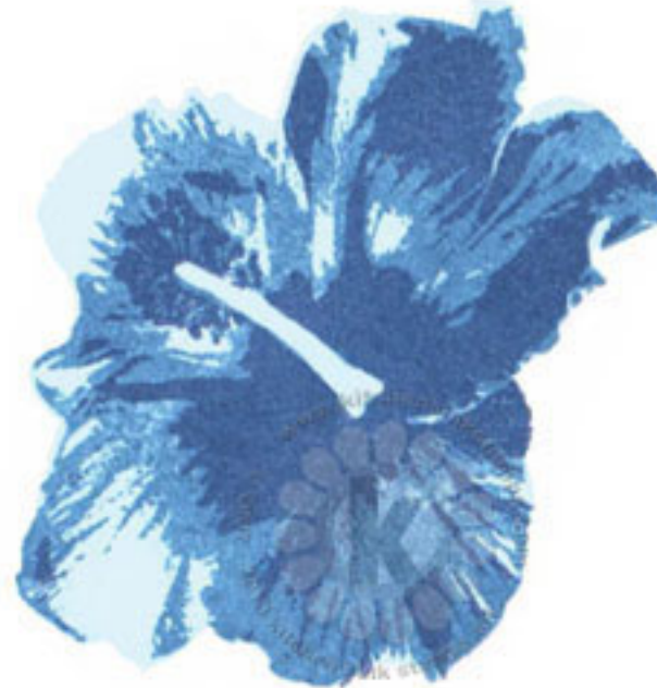
Step #1 Summer Sky stamp 2xs Memento