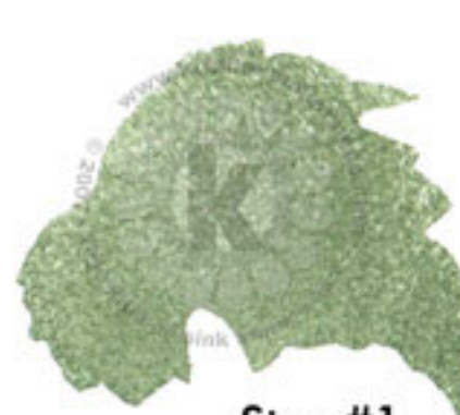
Step #1 Pearlescent Ivy Brilliance