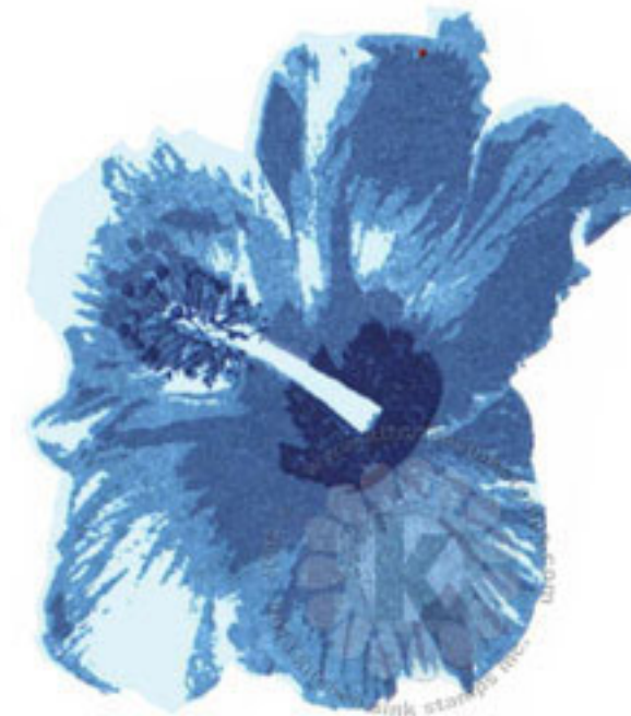
Step #4 Majestic Blue VersaFine