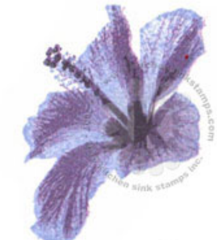
Step #4 Imperial Purple VersaFine