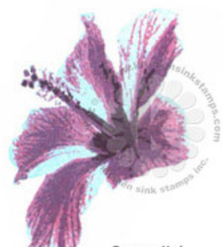
Step #4 Imperial Purple VersaFine