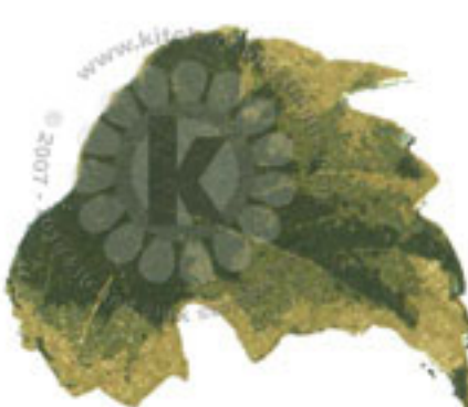
Step #3 Olympia Green Versa Fine