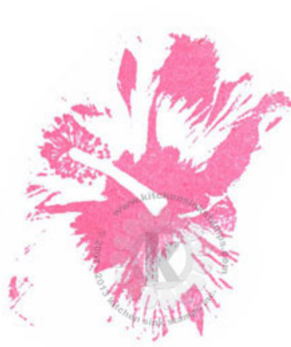
Step #3 Lilac Posies Memento