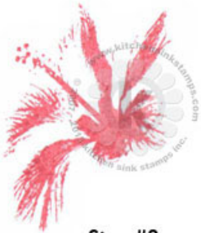
Step #3 Rhubarb Stalk Memento