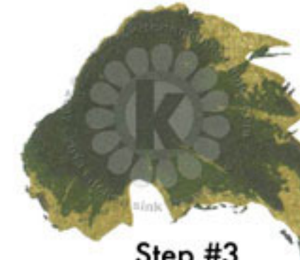
Step #3 Imperial Purple Versa Fine