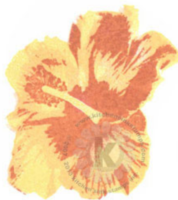
Step #1 Dandelion Memento