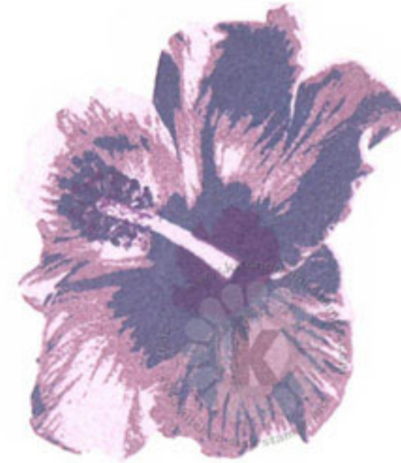
Step #4 Grape Jelly Memento