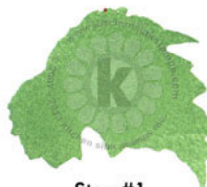
Step #1 Pearlescent Thyme Brilliance