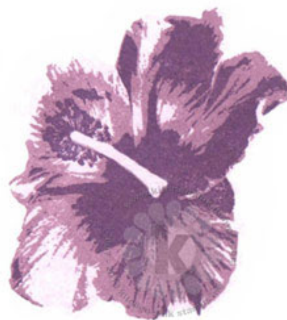
Step #3 Grape Jelly Memento