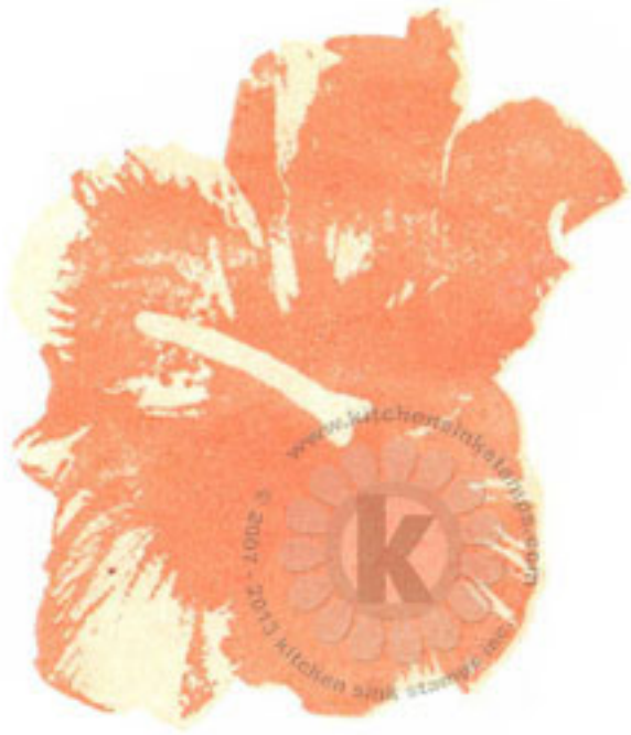
Step #2 Tangelo Memento