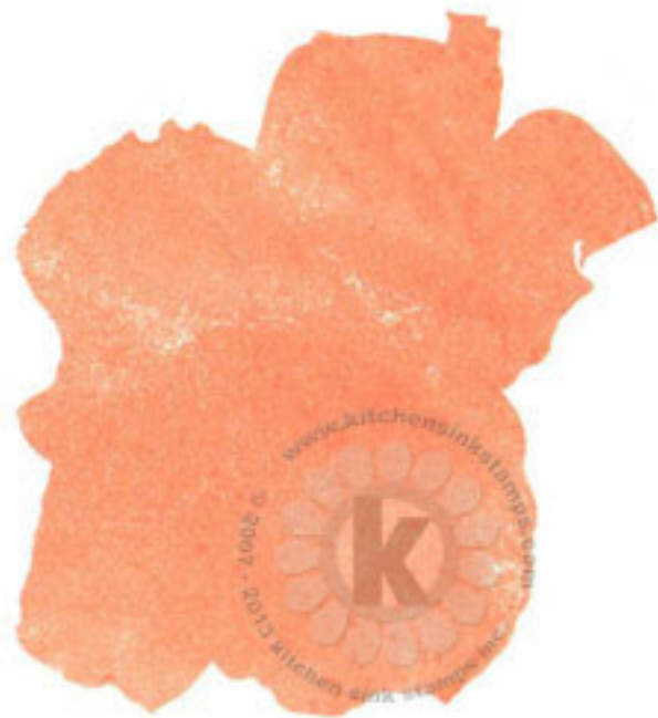
Step #1 Tangelo Memento