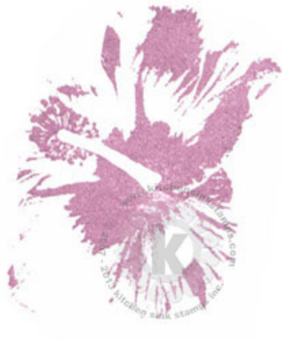
Step #3 Sweet Plum Memento