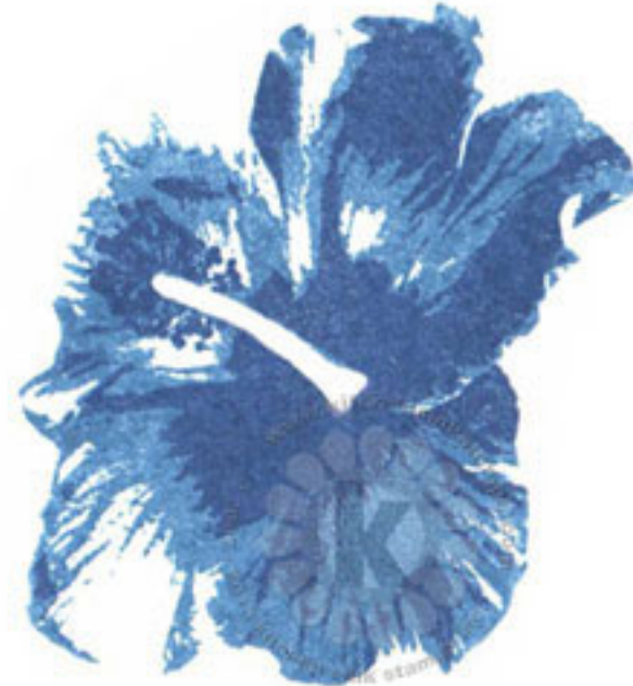
Step #2 Danube Blue stamp off 1x Memento