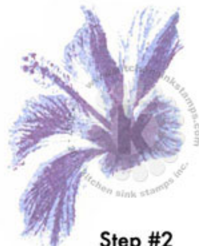
Step #2 Pearlescent Lavender Brilliance