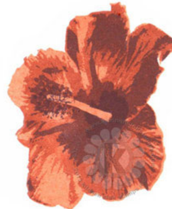
Step #4 Grape Jelly 2xs Memento