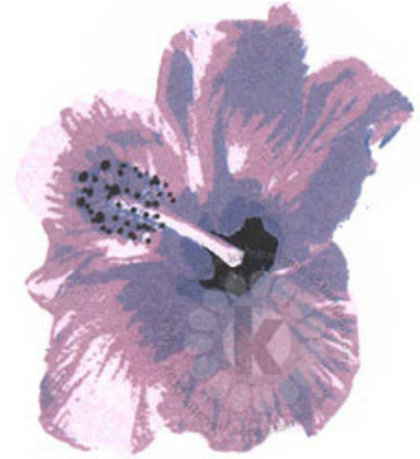
Step #5 Imperial Purple VersaFine