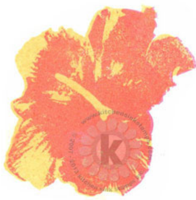
Step #2 Rose Bud Memento