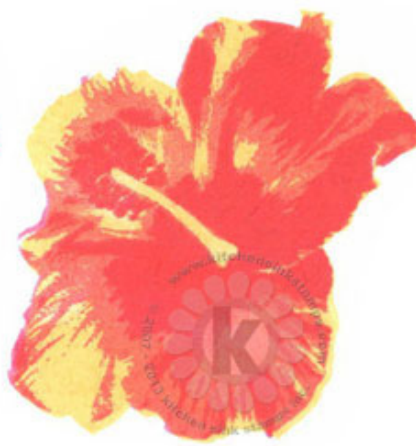
Step #3 Lilac Posies stamp 2x Memento