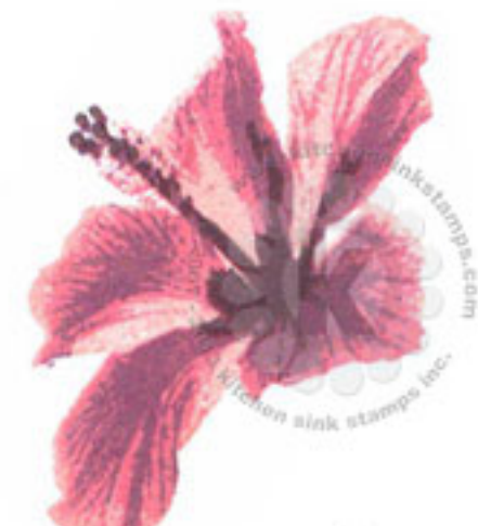
Step #4 Imperial Purple VersaFine