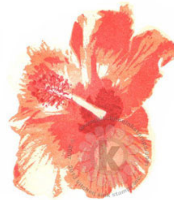
Step #4 Rhubarb Stalk Memento