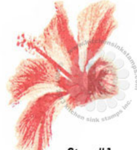
Step #1 Tangelo stamp off 1x Memento