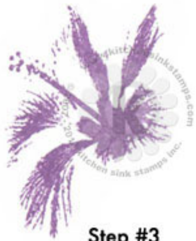
Step #3 Grape Jelly Memento