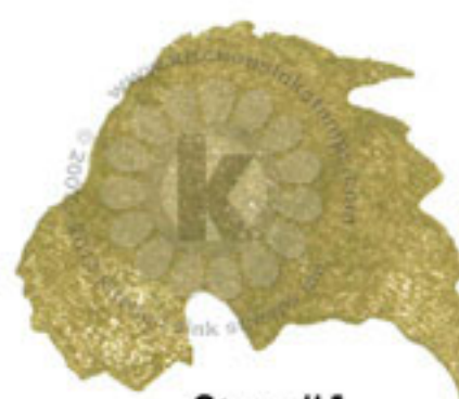
Step #1 Spanish Moss Versa Fine