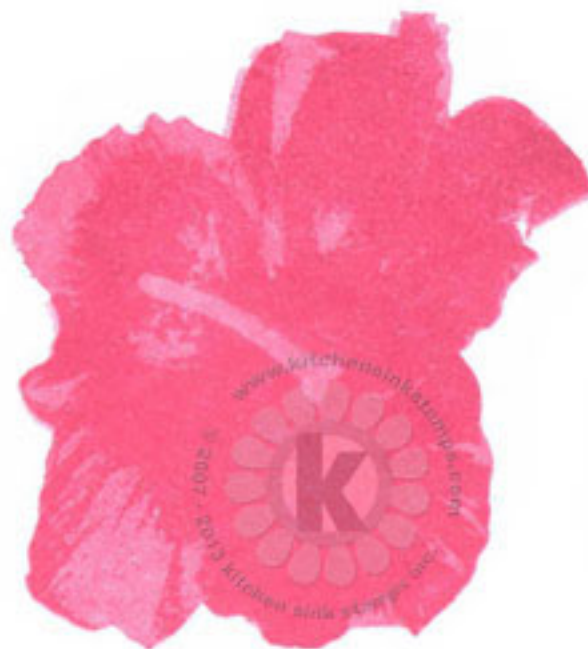
Step #2 Lilac Posies Memento