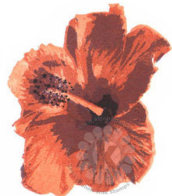
Step #5 Imperial Purple VersaFine