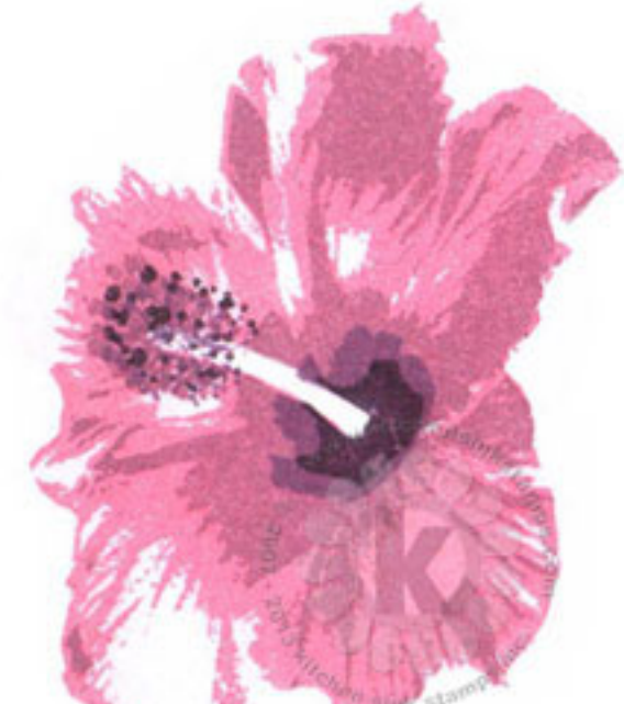
Step #5 Imperial Purple VersaFine