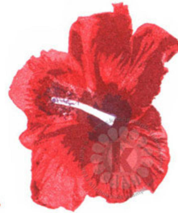
Step #4 Grape Jelly Memento