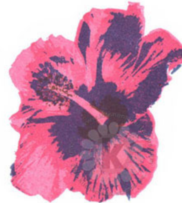
Step #4 Rich Cocoa Memento