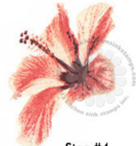
Step #4 Imperial Purple VersaFine