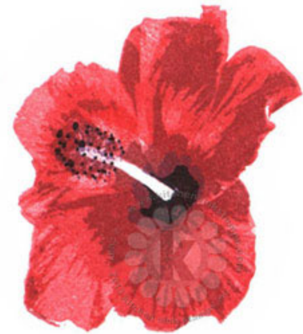
Step #5 Onyx Black VersaFine