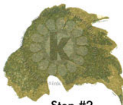
Step #2 Pearlescent Ivy Brilliance