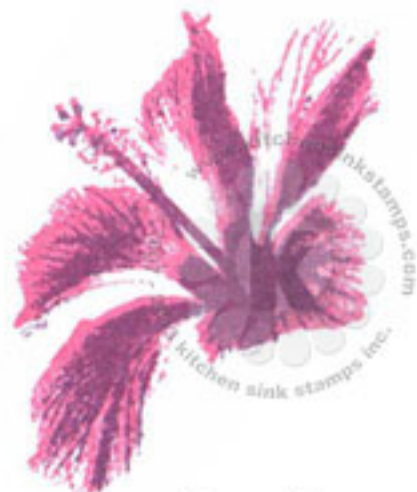
Step #2 Lilac Posies Memento