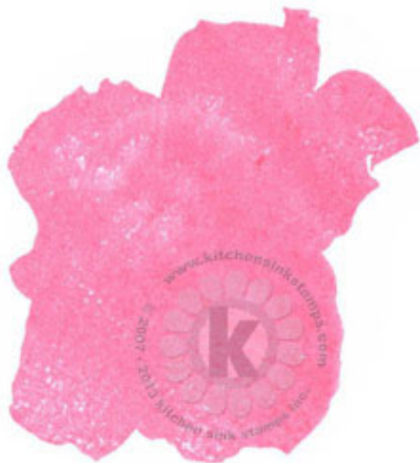
Step #1 Rose Bud Memento