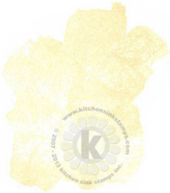
Step #1 Canteloupe Memento