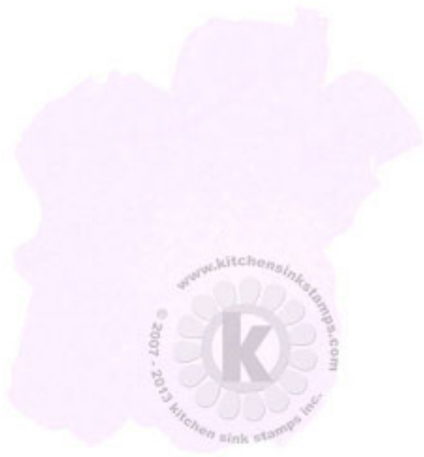
Step #1 Lulu Lavender Memento