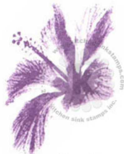
Step #2 Grape Jelly - stamp off 1x Memento