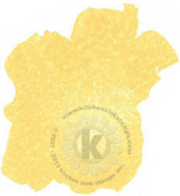
Step #1 Dandelion Memento