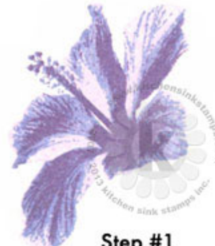
Step #1 Lulu Lavender Memento