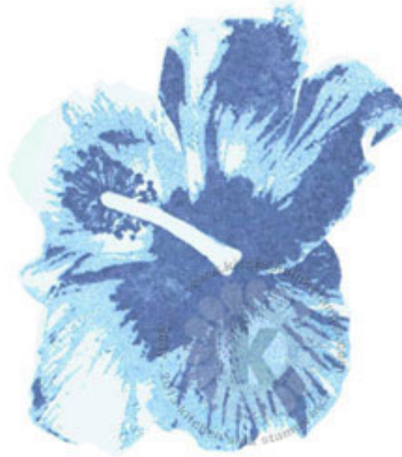
Step #1 Summer Sky Memento