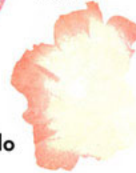
exaple how stamp looks inked