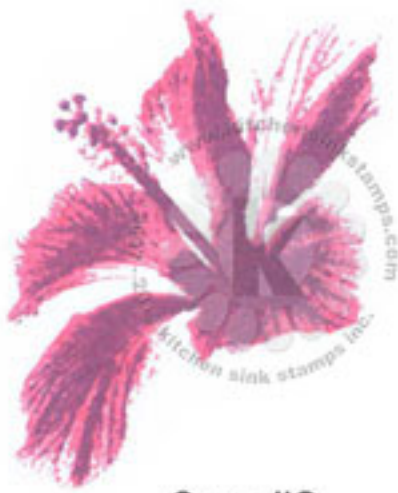
Step #2 Rose Bud Brilliance