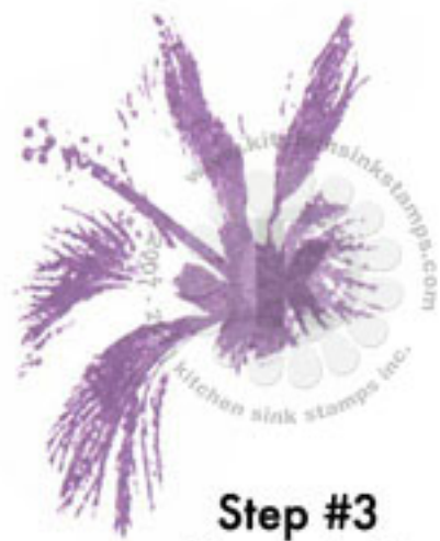
Step #3 Grape Jelly Memento