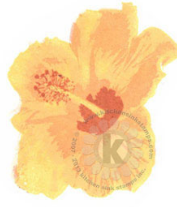
Step #4 Potter's Clay Memento