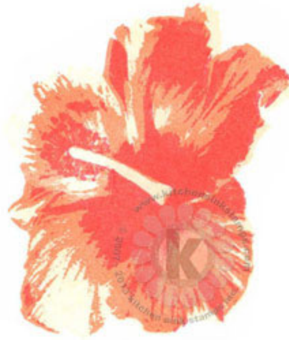
Step #3 Lady Bug Memento