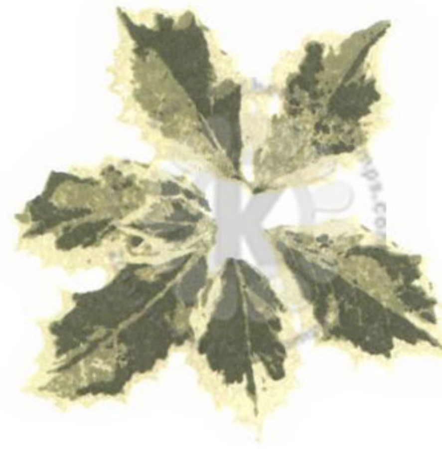
Step #3 Olive Grove Step #2 Pistachio Step #1 Toffee Crunch stamp off 1x + New Sprout