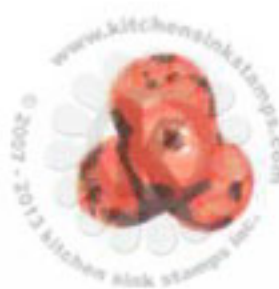
Step #3 Elderberry Step #2 Morocco Step #1 Tangelo