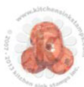
Step #3 Grape Jelly Step #2 Potter's Clay Step #1 Tangelo