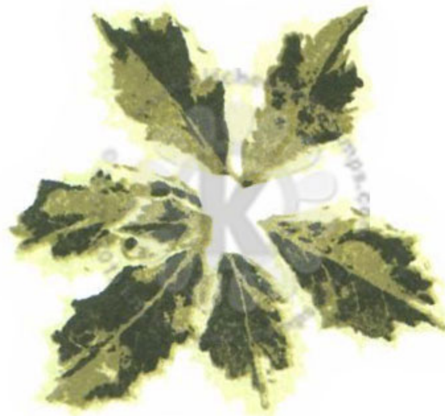
Step #3 Northern Pine Step #2 Pistachio + Pear Tart Step #1 New Sprout