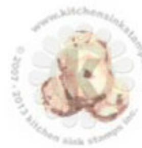
Step #3 Rich Cocoa Step #2 Toffee Crunch stamp off 1x, Repeat Step #1 Cantaloupe stamp off 1x, Repeat