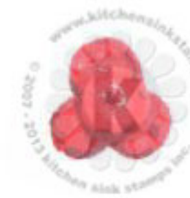
Step #3 Sweet Plum Step #2 Love Letter Step #1 Lady Bug