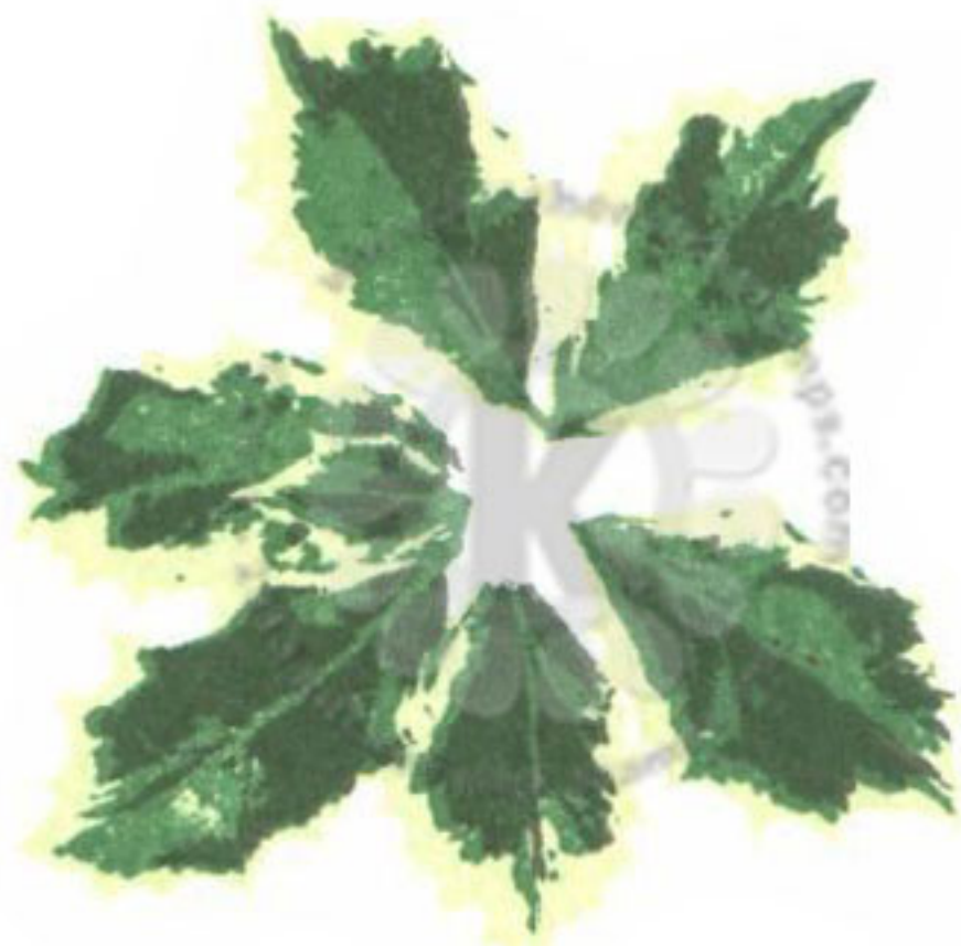
Step #3 Olive Grove Step #2 Cottage Ivy Step #1 New Sprout