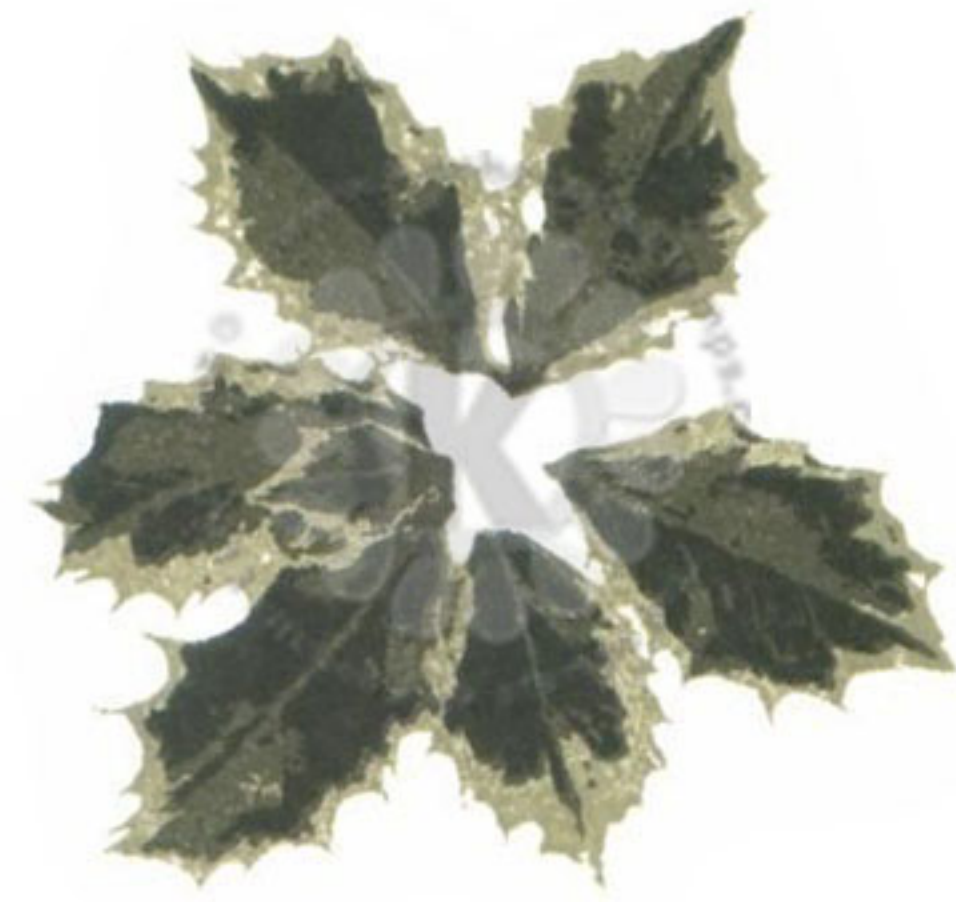
Step #3 Northern Pine Step #2 Olive Grove Step #1 Pistachio