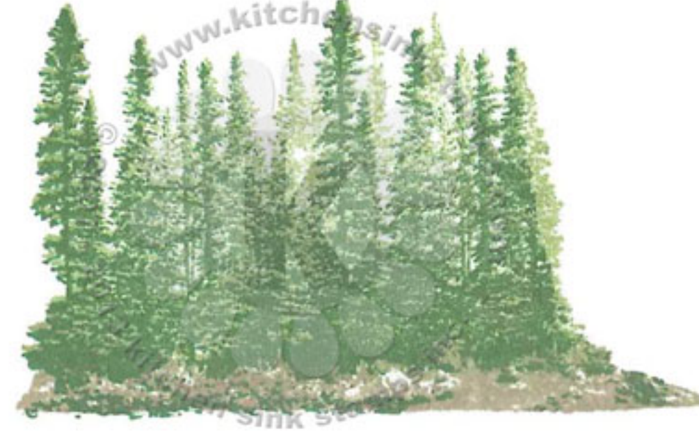
Step #2 - Cottage Ivy