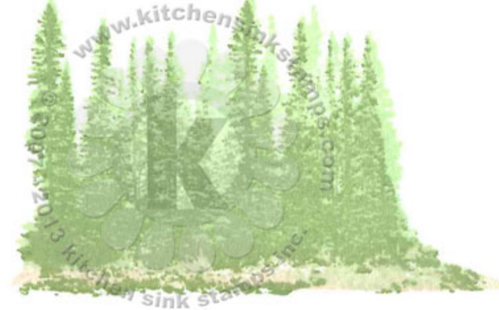
Step #2 - Bamboo Leaves