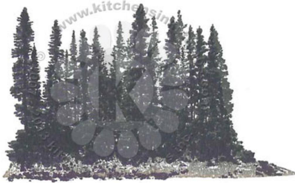
Step #2 - Elderberry