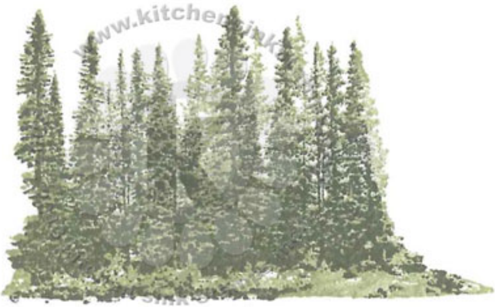
Step #2 - Olive Grove