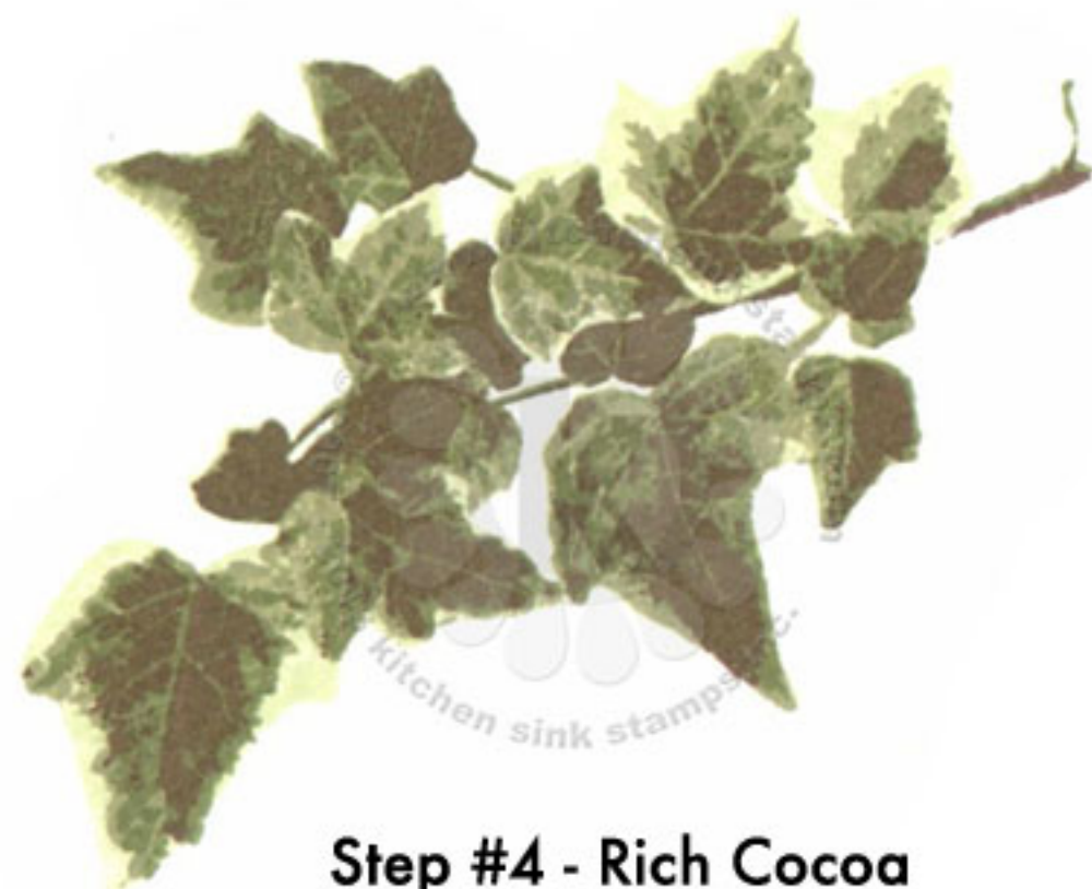
Step #4 - Rich Cocoa