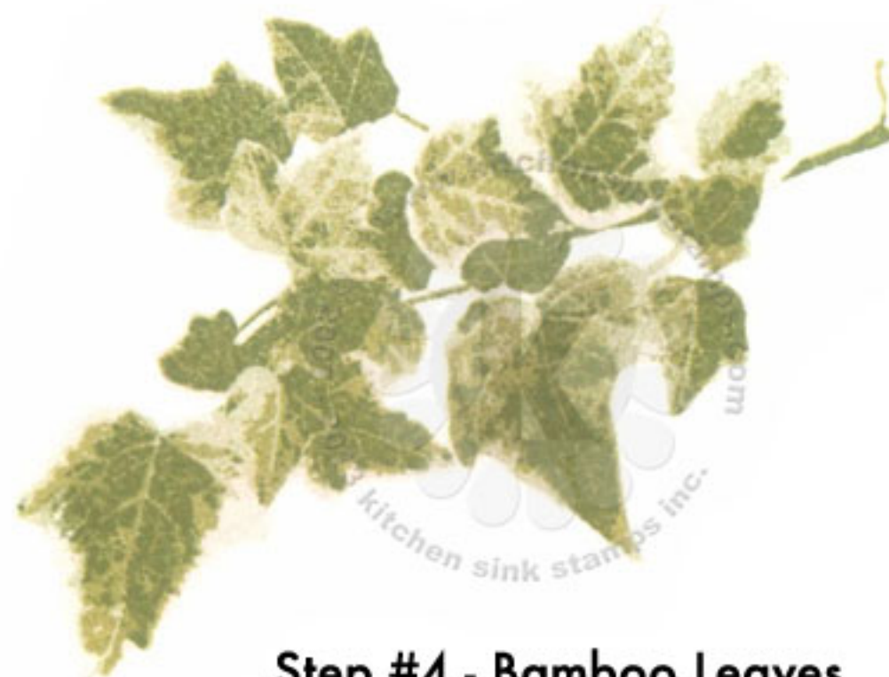
Step #4 - Bamboo Leaves