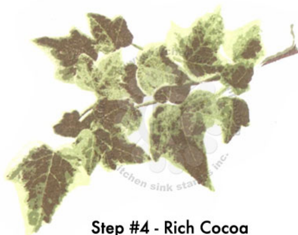
Step #4 - Rich Cocoa