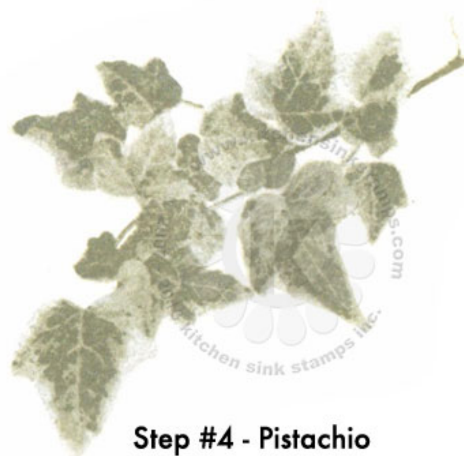
Step #4 - Pistachio