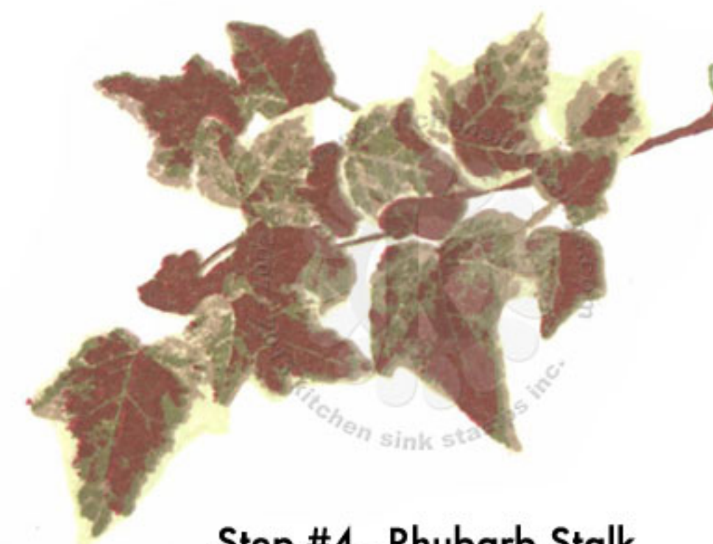
Step #4 - Rhubarb Stalk