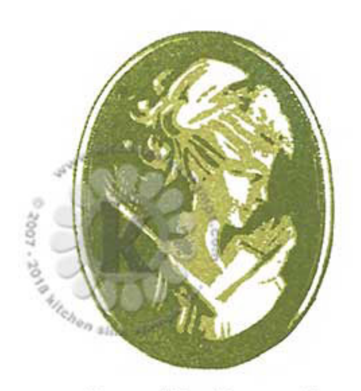
Step #2 - Green Tea