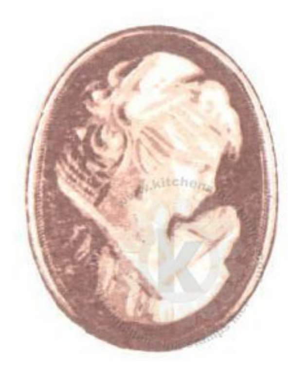
Step #4 Rich Cocoa