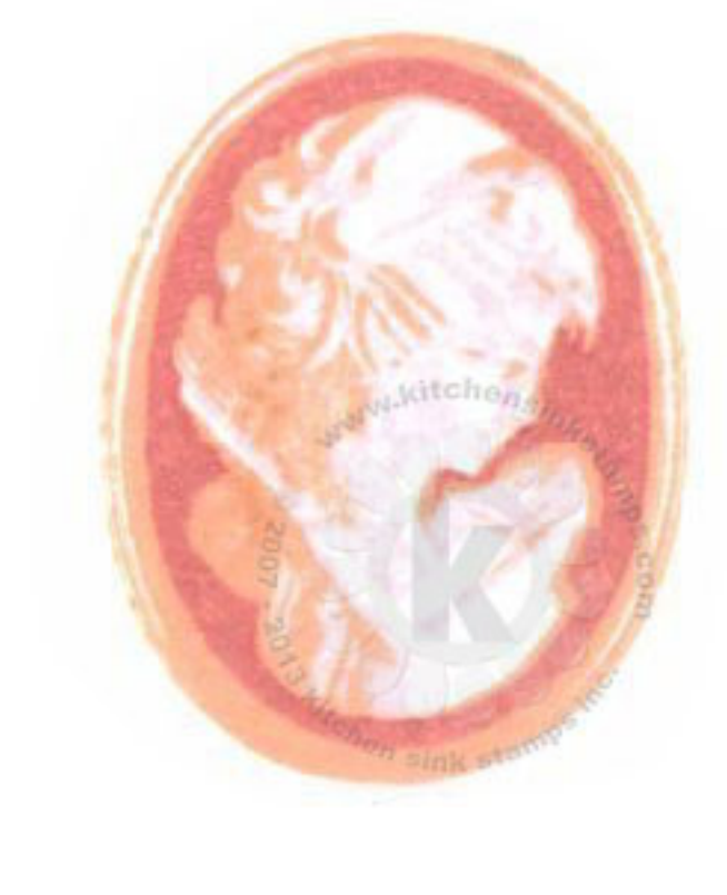
Step #5 - Rhubarb Stalk