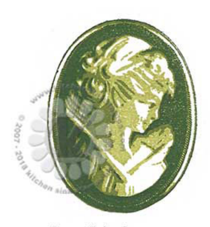
Step #4 - Spruce