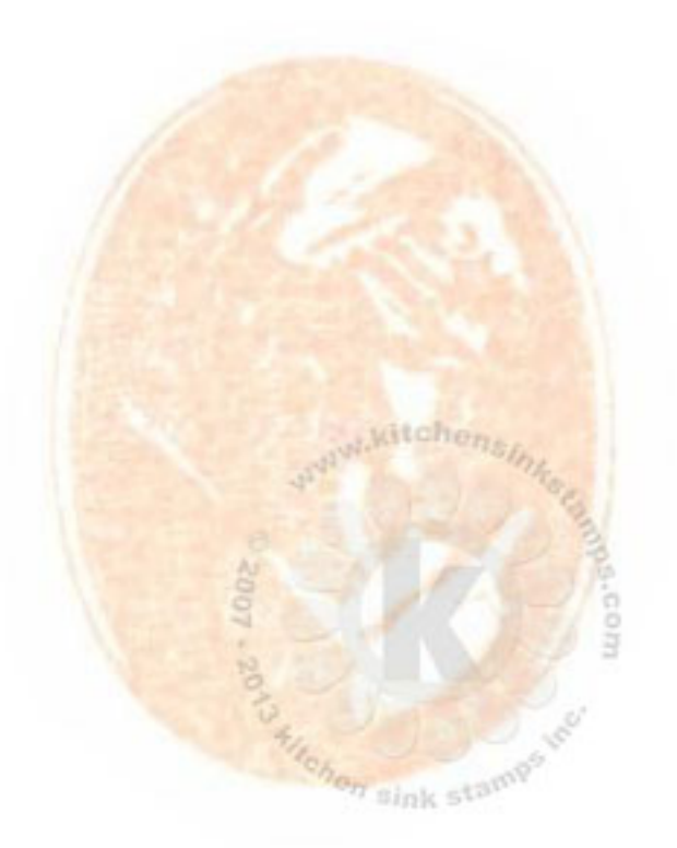
Step #2 Desert Sand