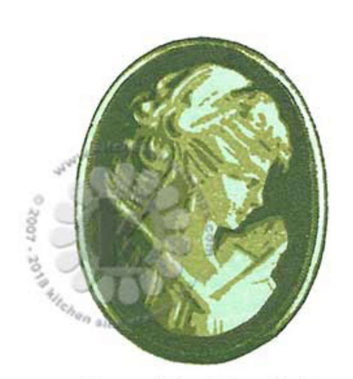
Step #1 - Mint To Be