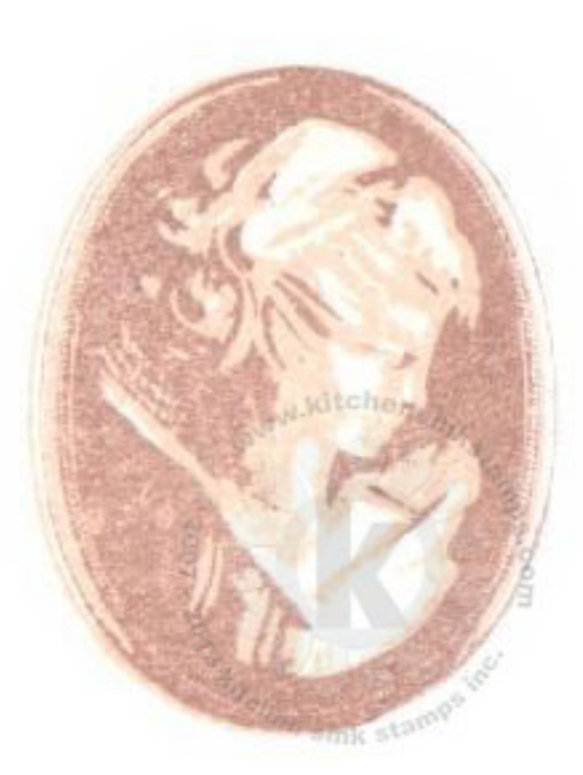
Step #3 Rich Cocoa stamp off 1x