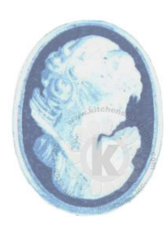
Step #5 - Paris Dusk