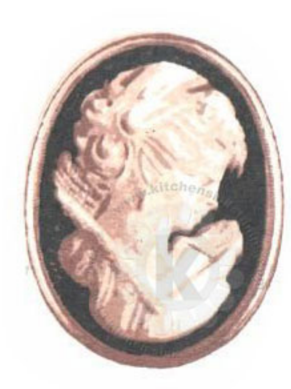
Step #5 Tuxedo Black