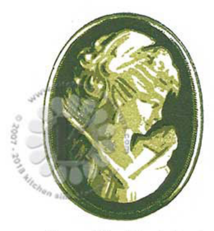
Step #5 - Black Jack