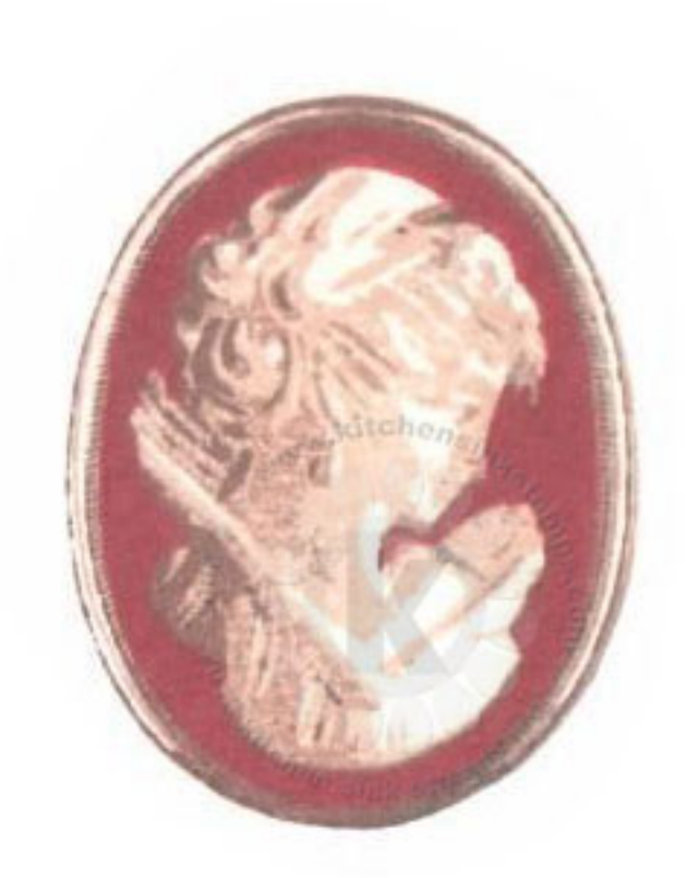
Step #4 - Rich Cocoa