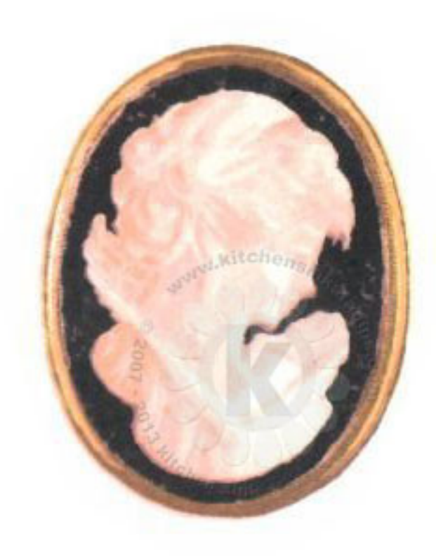
Step #5 - Tuxedo Black