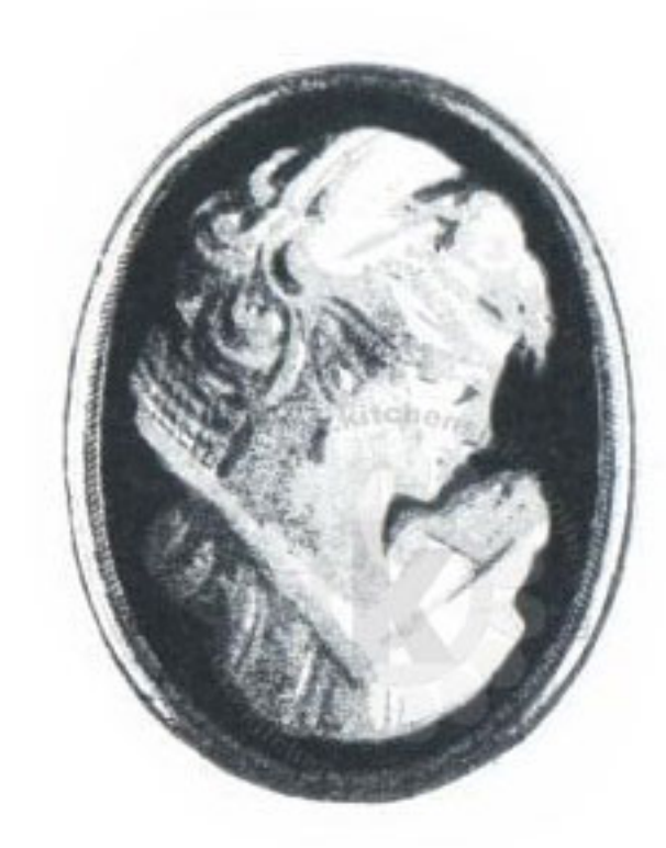
Step #5 - Tuxedo Black

Step #4 - Tuxedo Black stamp off 1x, repeat