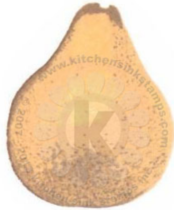
Step #4 - Rich Cocoa Step #3 - Rich Cocoa stamp off 1x, repeat Step #2 - Desert Sand 2x's Step #1 - Desert Sand + Dandelion