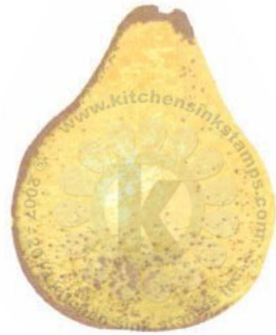
Step #4 - Sweet Plum Step #3 - Pear Tart Step #2 - New Sprout Step #1 - Dandelion