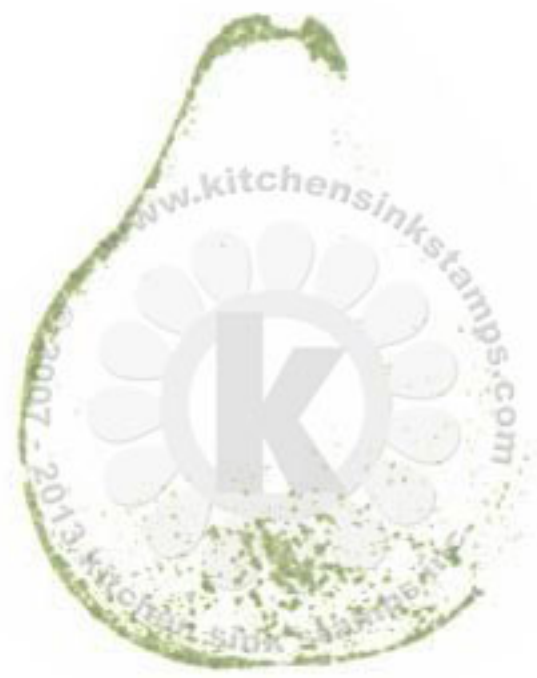
Step #4 Bamboo Leaves