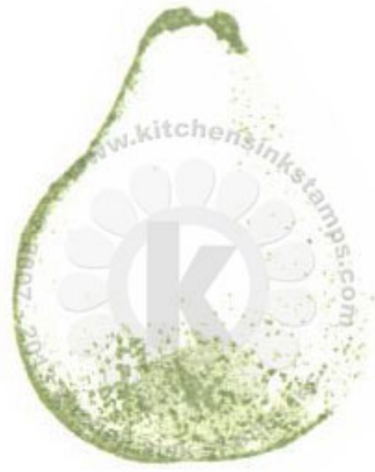
Step #3 Bamboo Leaves stamp off 1x