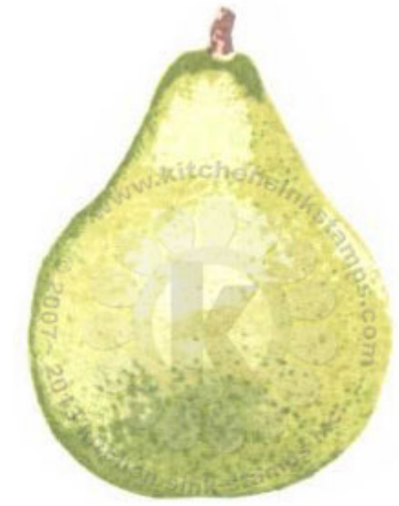
STEM Step #5 - Desert Sand Step #6 - Rich Cocoa