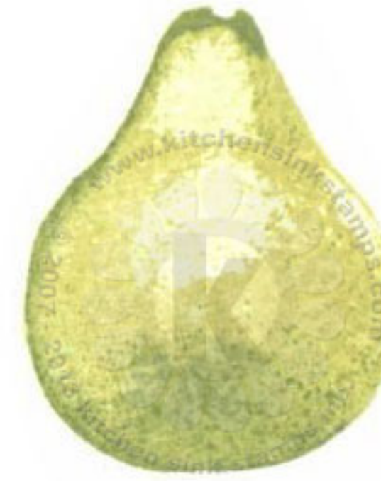
Step #1 New Sprout