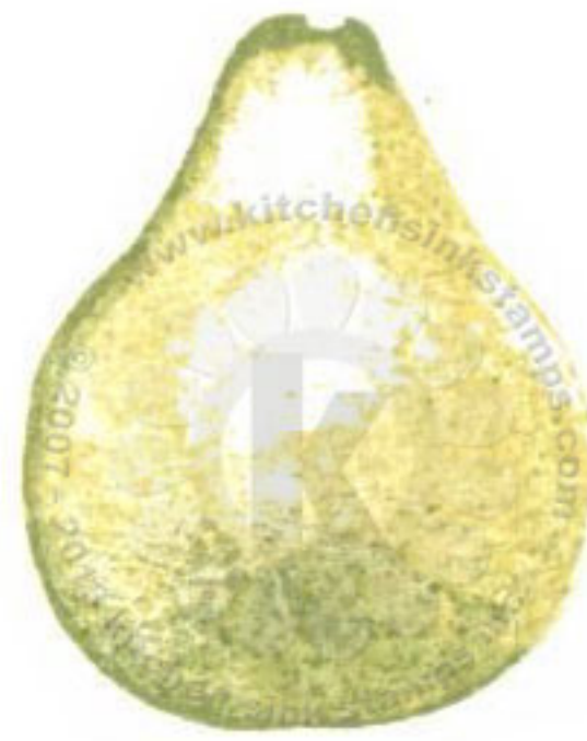
Step #2 Pear Tart