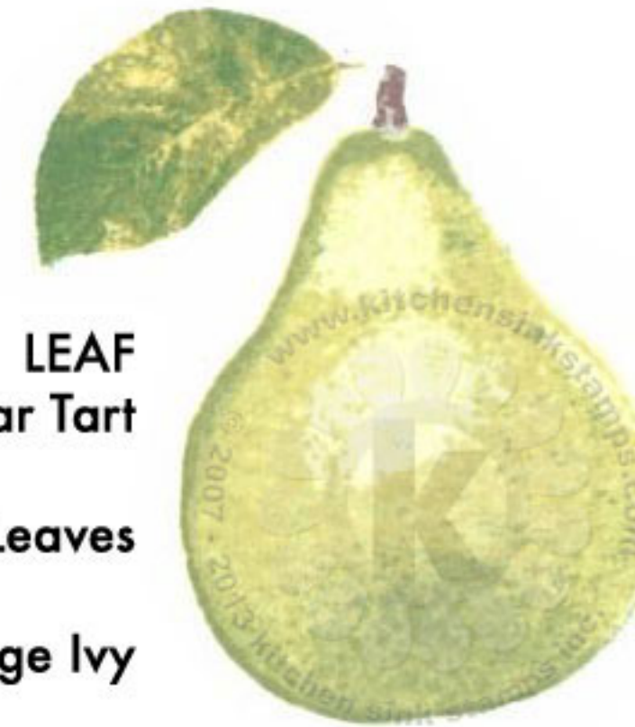
LEAF Step #1 - Pear Tart Step #2 - Bamboo Leaves Step #3 - Cottage Ivy