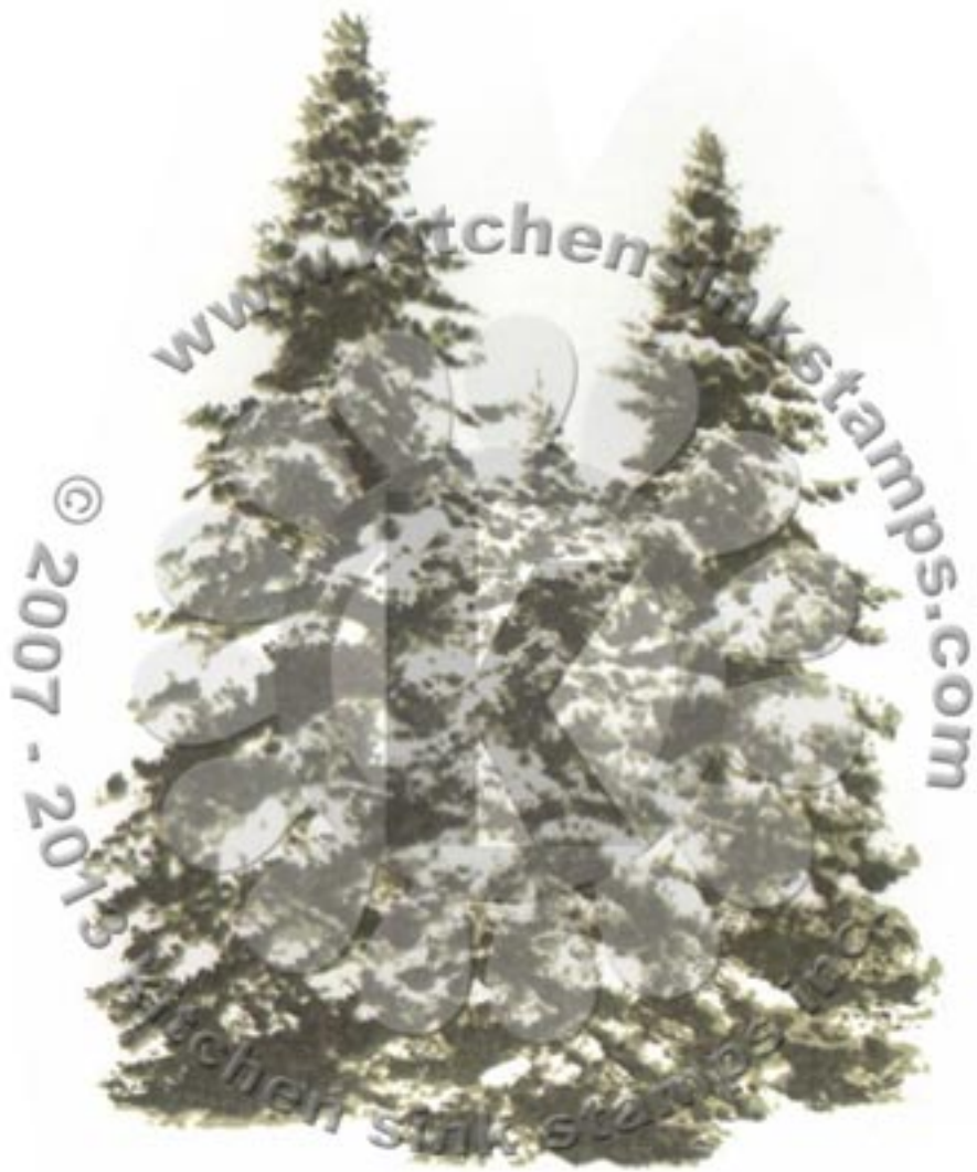
Step #3 - Espresso Truffle