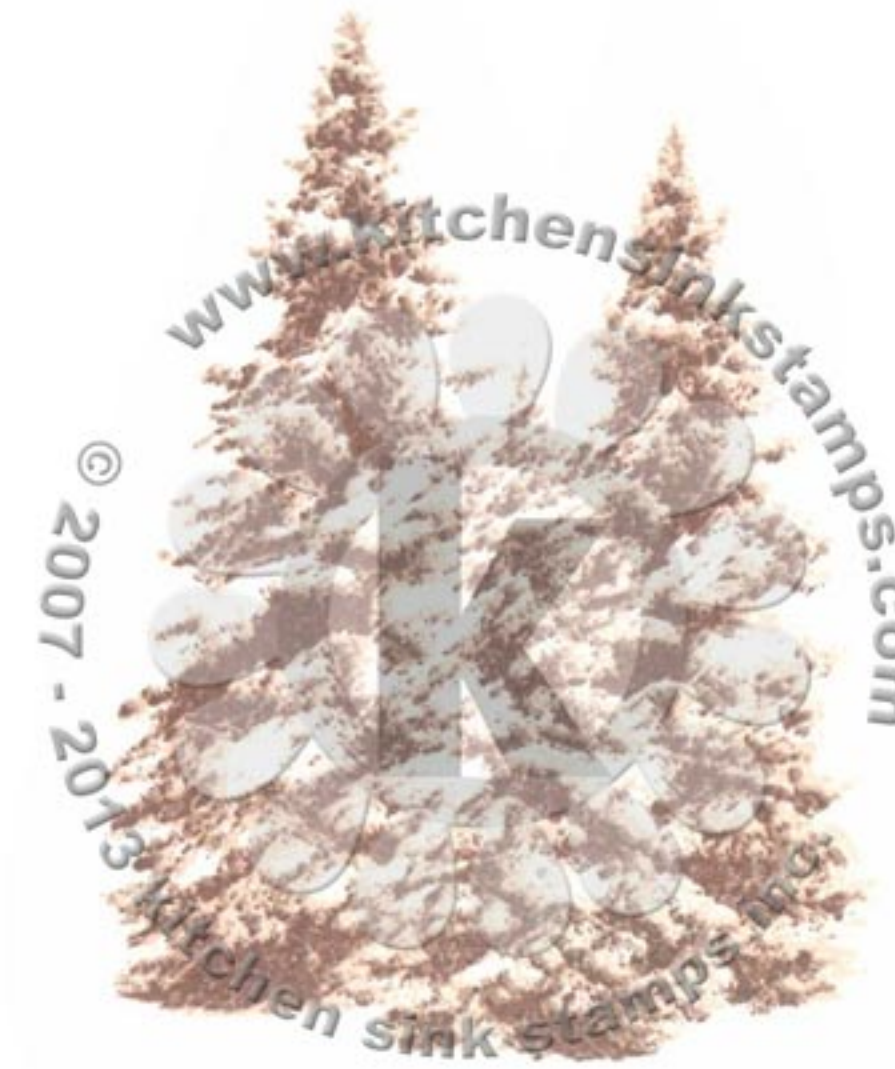
Step #3 - Rich Cocoa