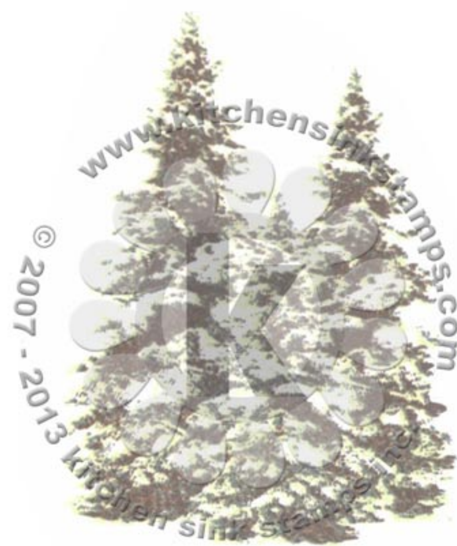
Step #3 - Rich Cocoa