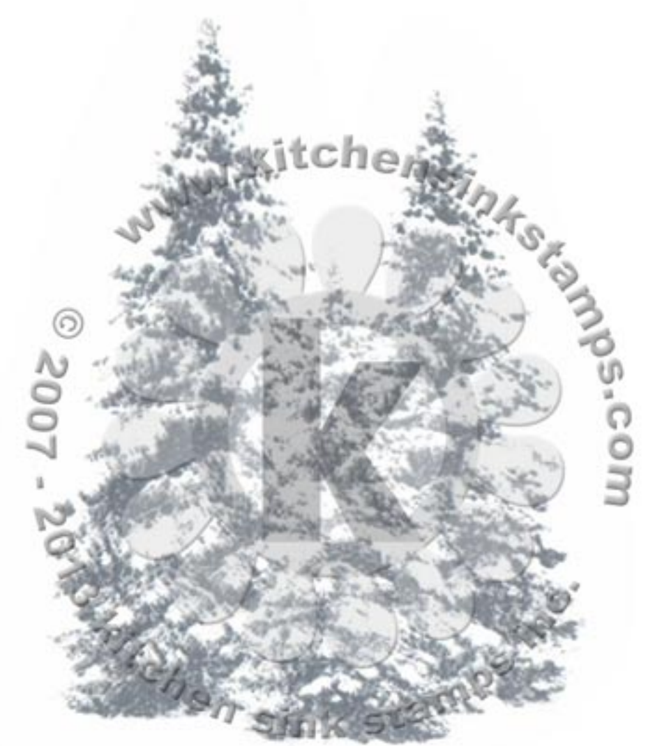
Step #3 - Gray Flannel