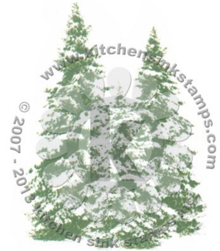
Step #3 - Cottage Ivy