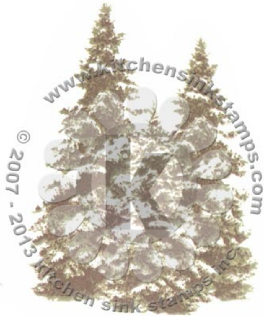
Step #3 - Rich Cocoa