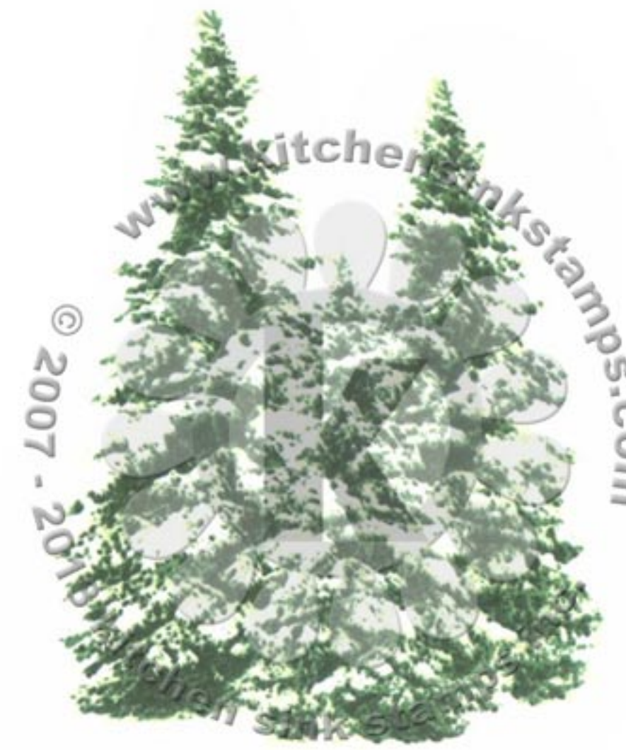
Step #3 - Northern Pine