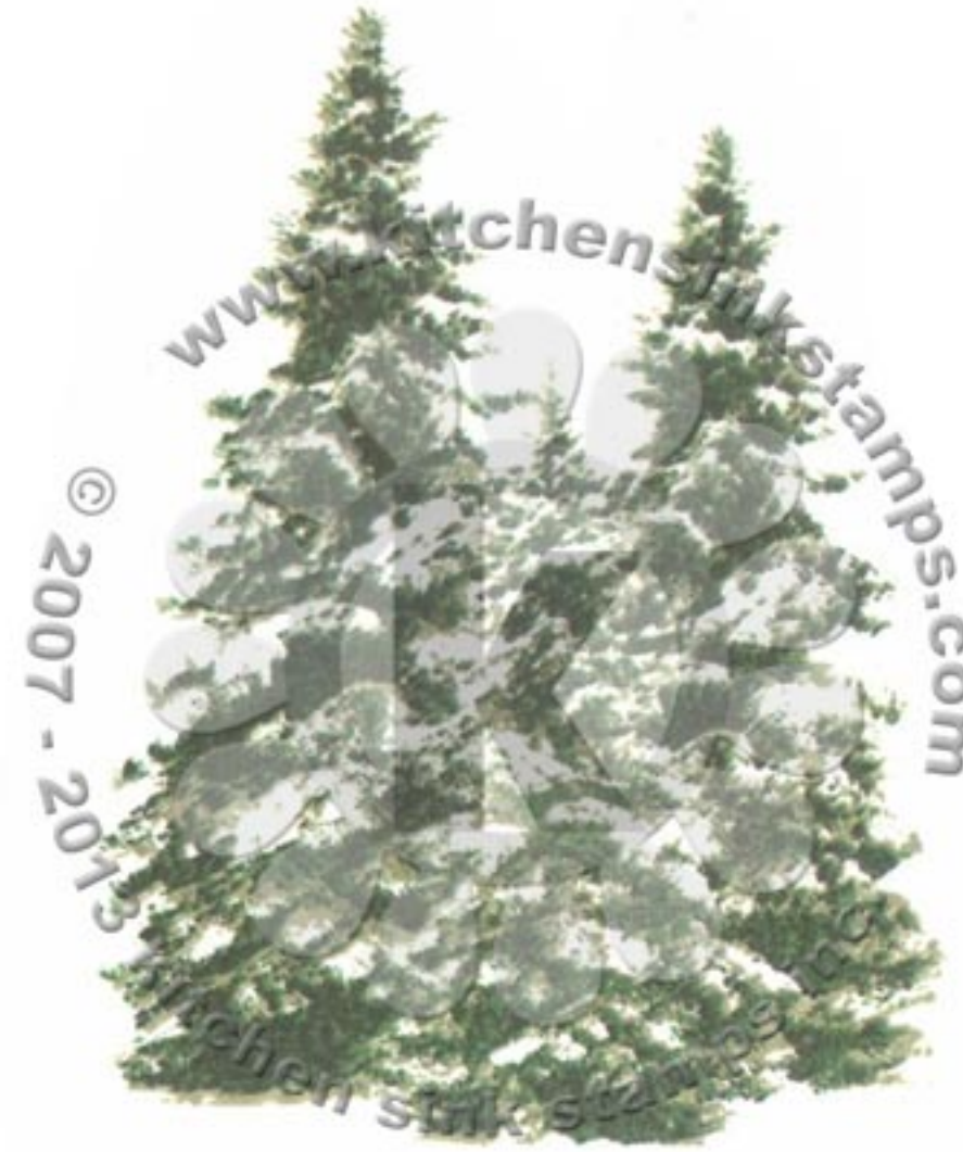
Step #3 - Espresso Truffle