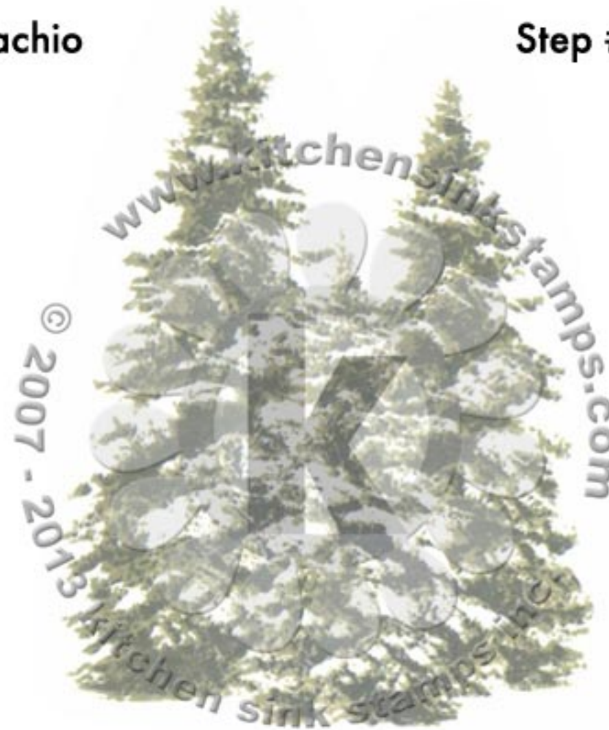
Step #3 - Gray Flannel