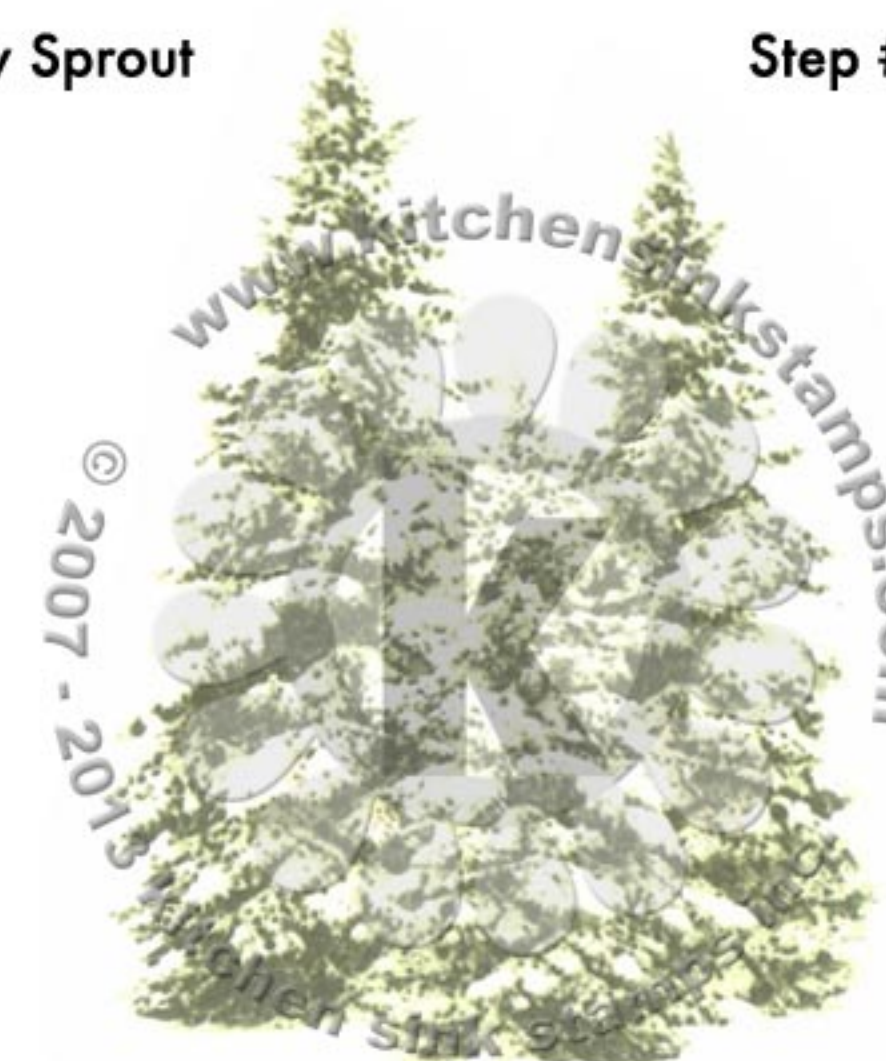
Step #3 - Olive Grove