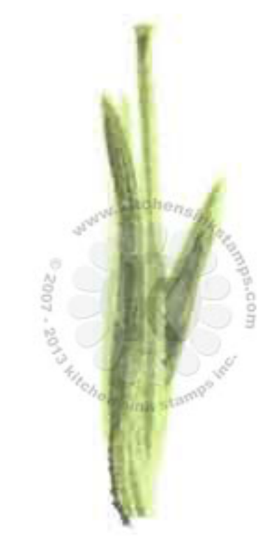
Step #4 - Olive Grove