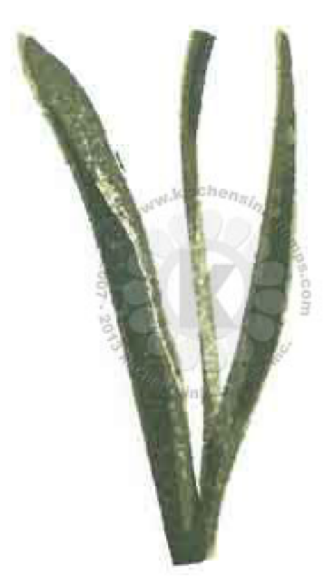
Step #3 - Northern Pine