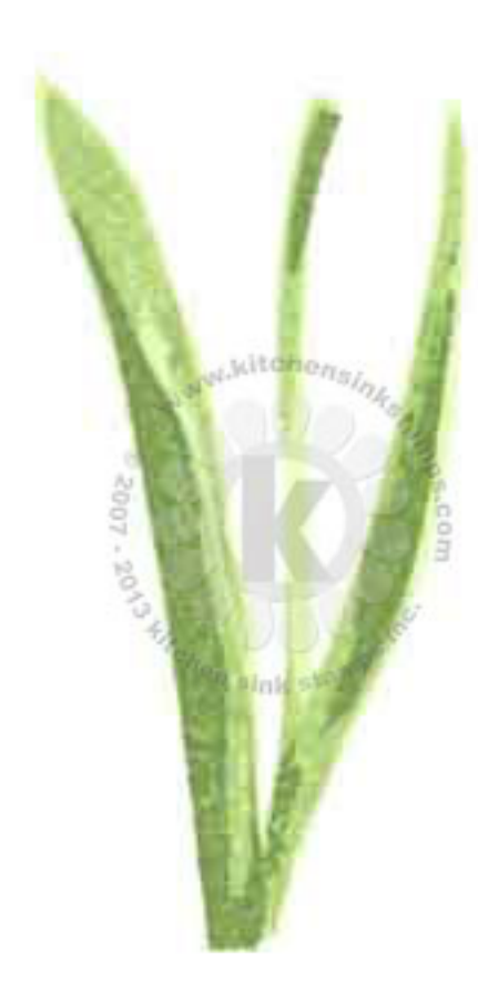
Step #3 - Bamboo Leaves

Step #2 - Bamboo Leaves, stamp off 1x, repeat