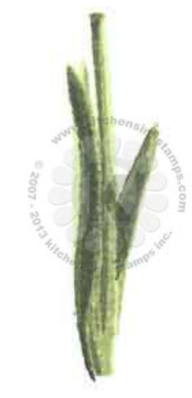
Step #4 - Northern Pine