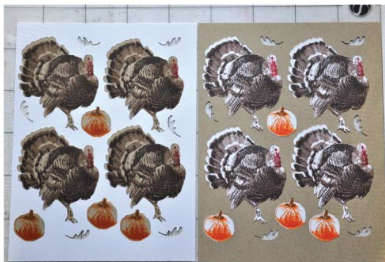
2] Step #2