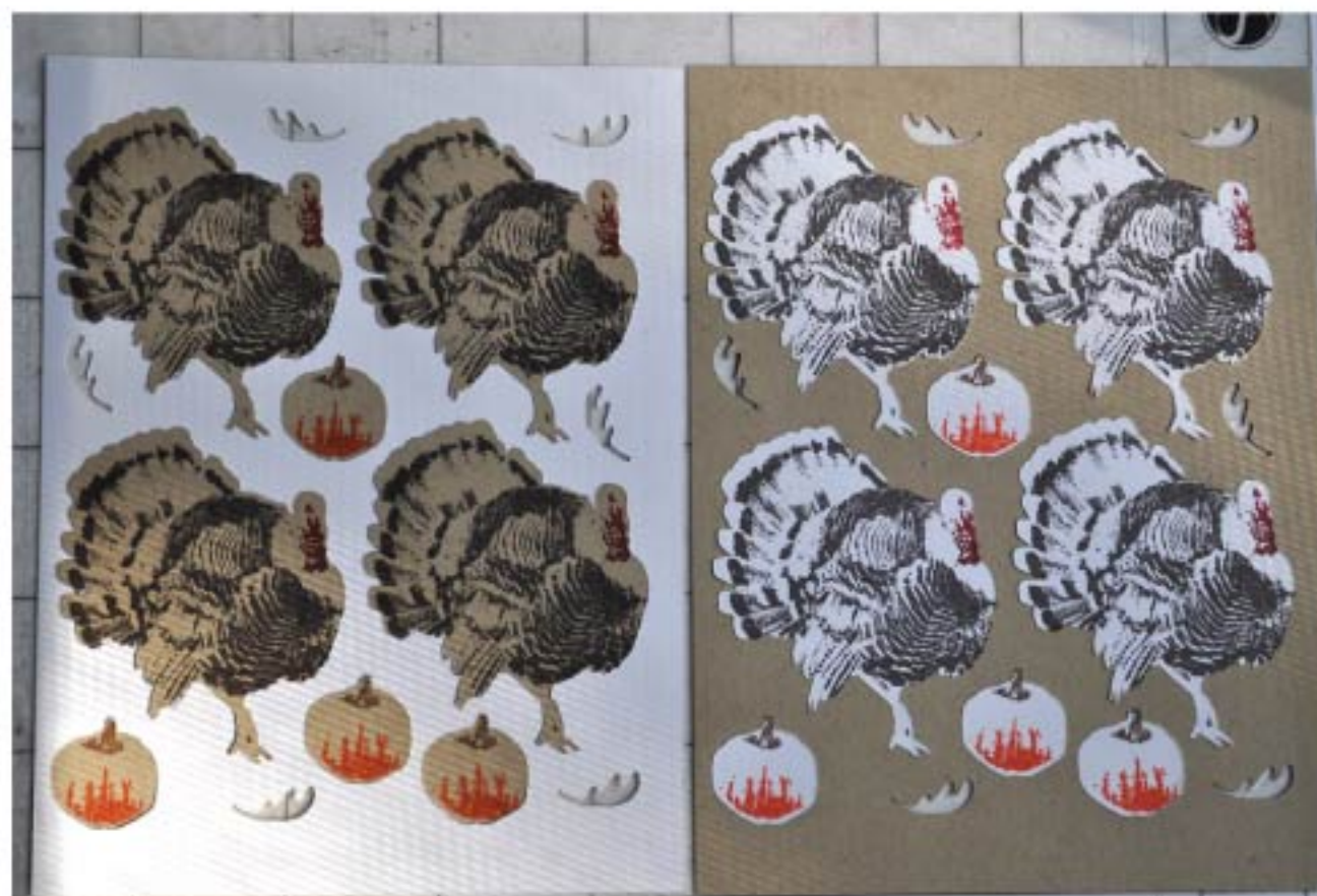
1] Step #3