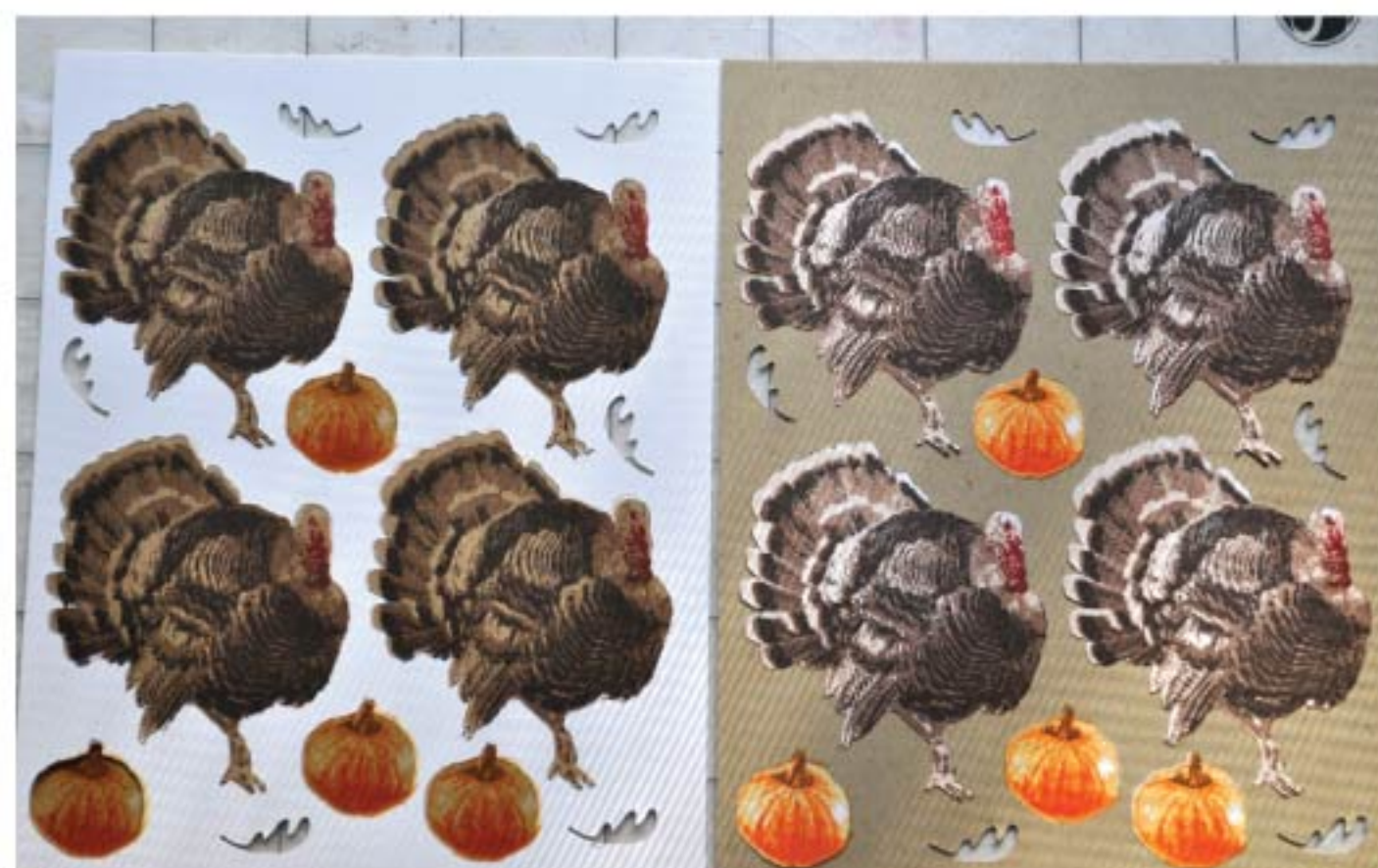
3] Step #1