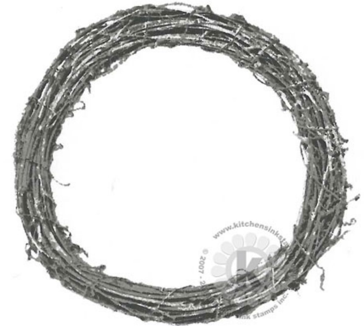
Step #4 - Nocturne (VersaFine Clair)