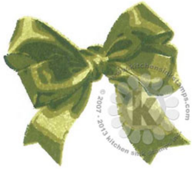
Step #4 - Spruce