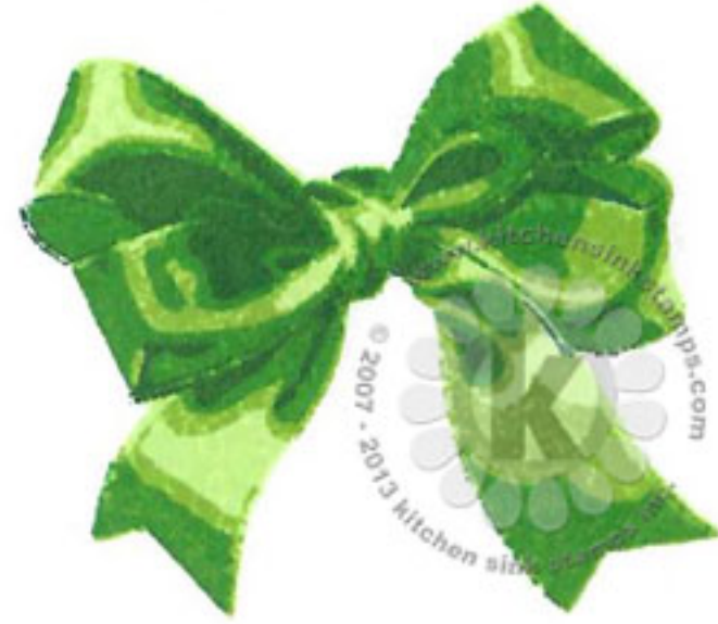
Step #4 - Deck the Halls