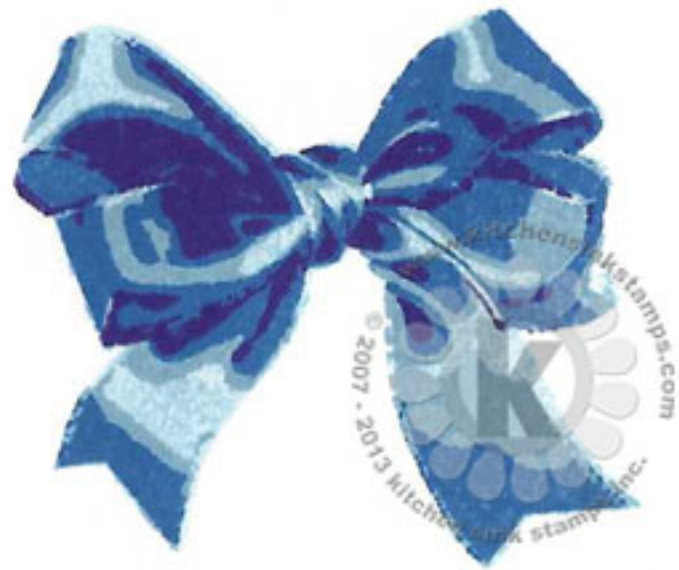
Step #4 - Queen for the Day