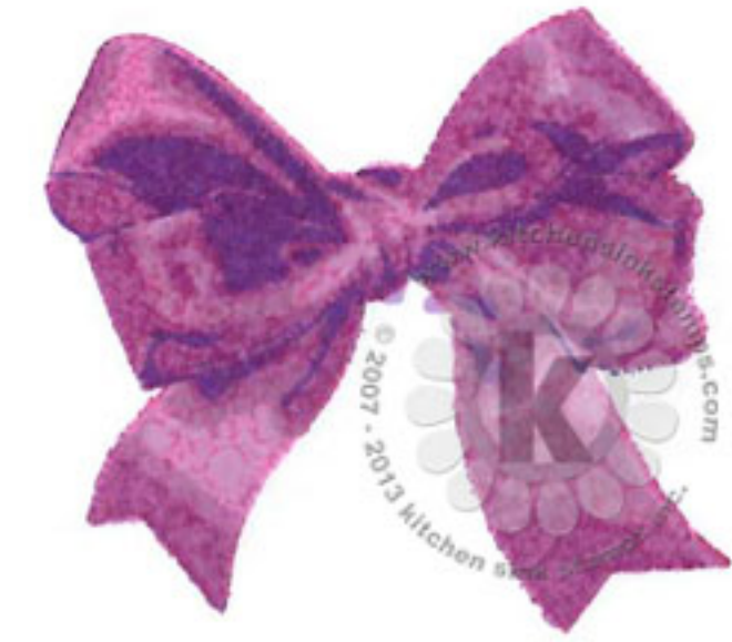
Step #4 - Grape Crush