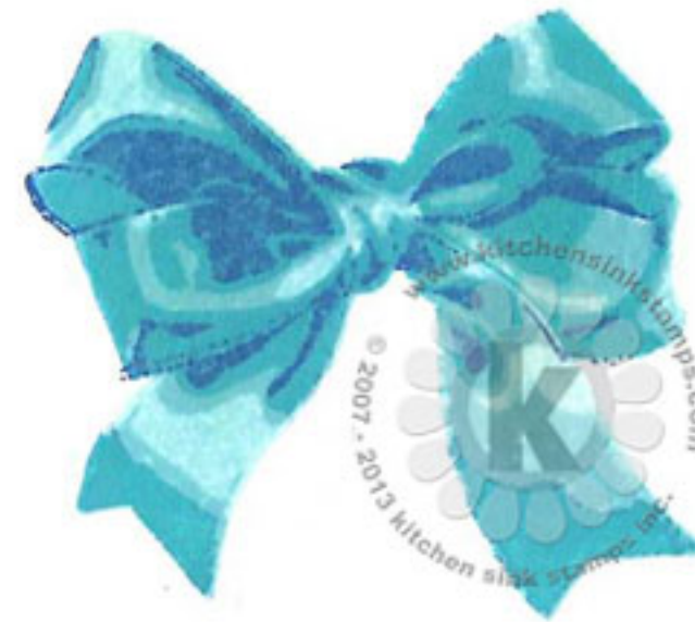
Step #4 - Suede Shoes