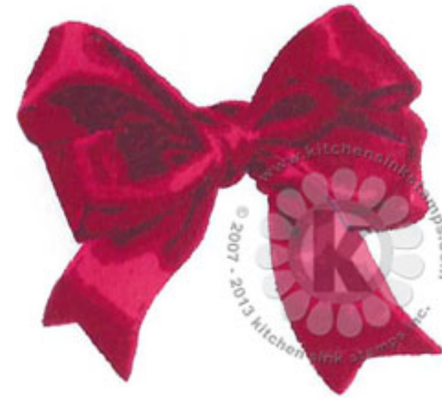
Step #4 - Grape Crush