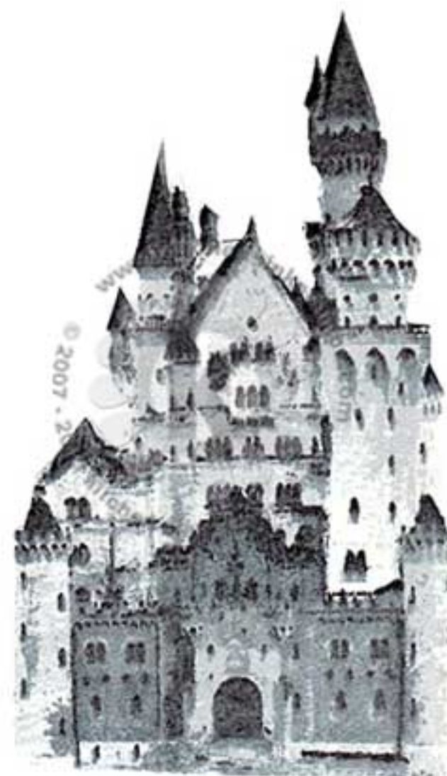
Step #1A - Limestone