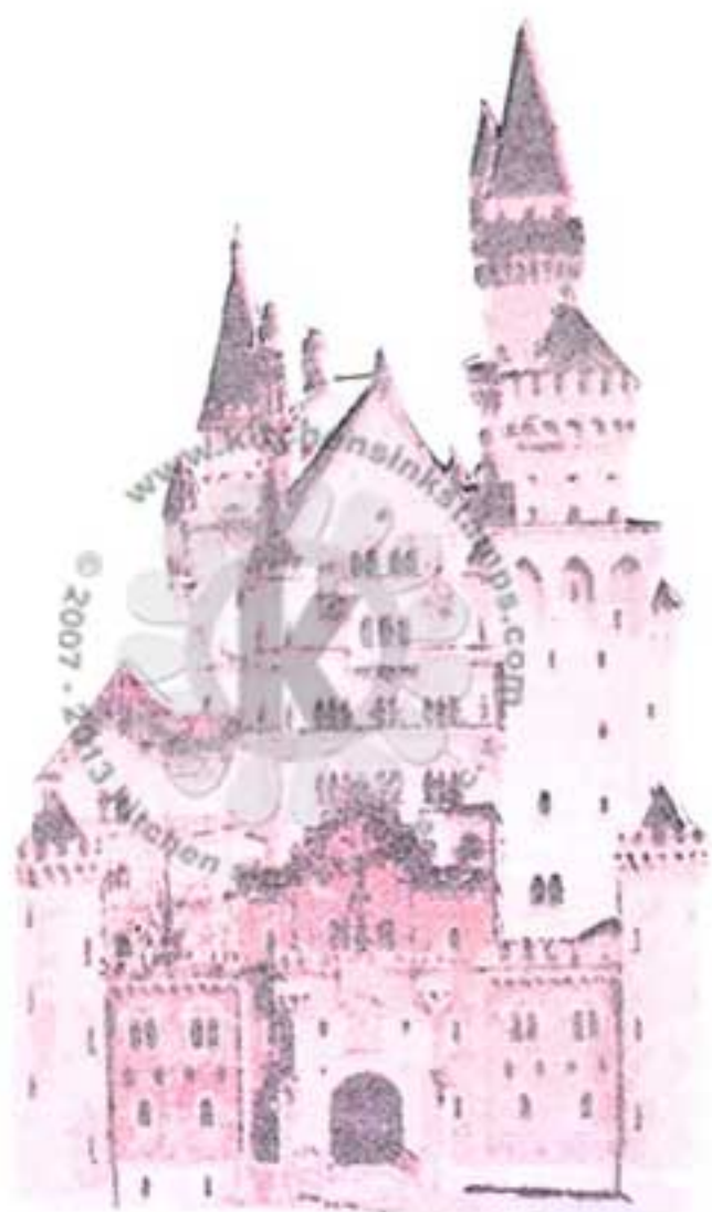
Step #1A - Blush