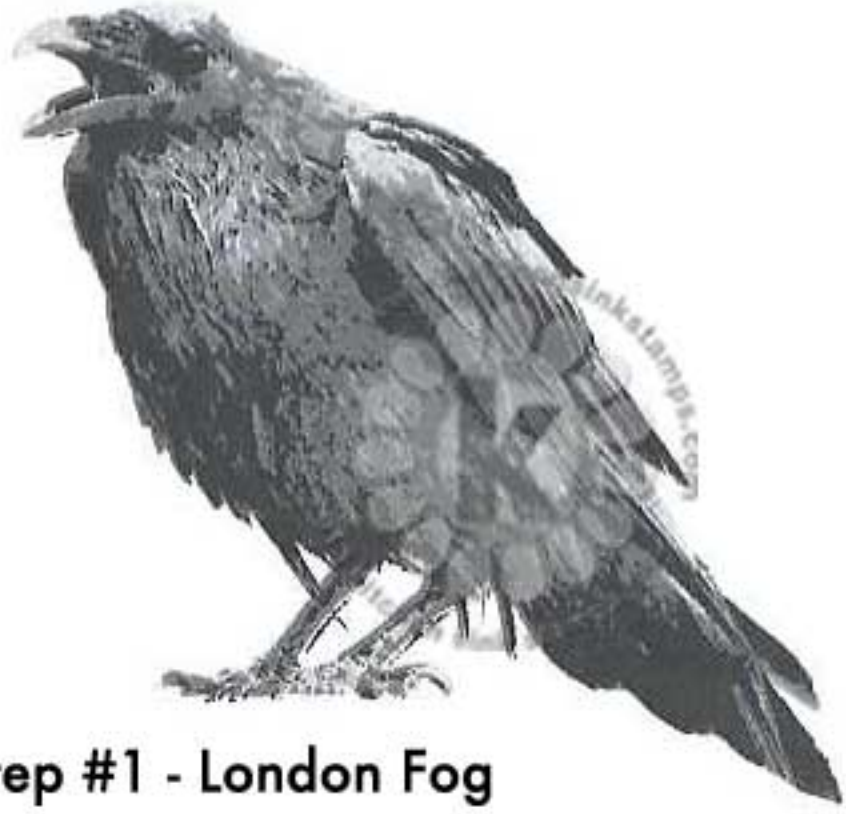
Step #1 - London Fog