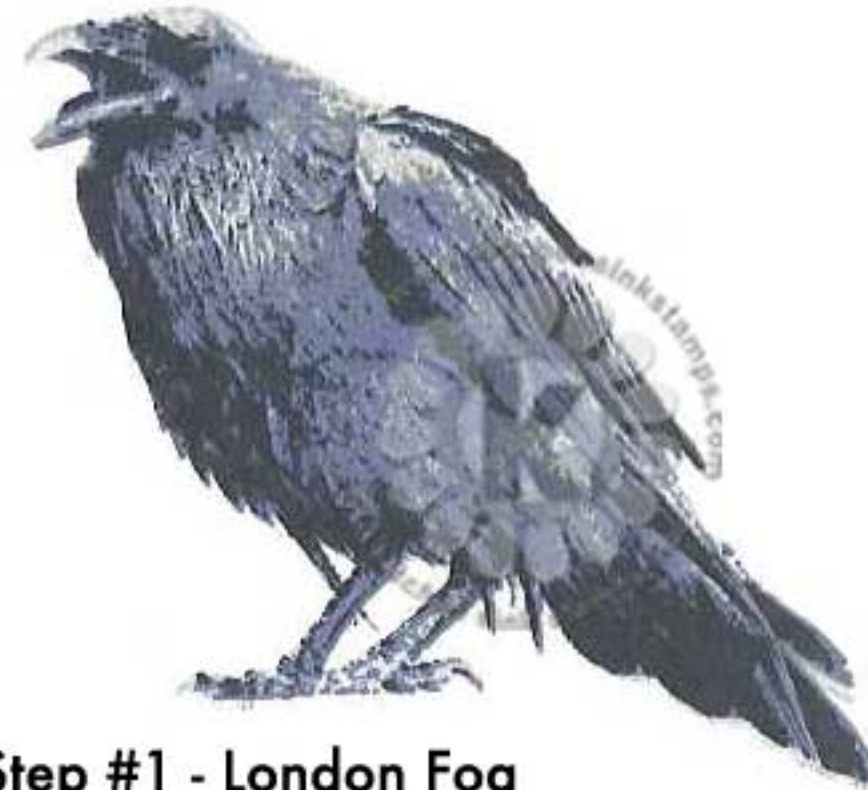
Step #1 - London Fog