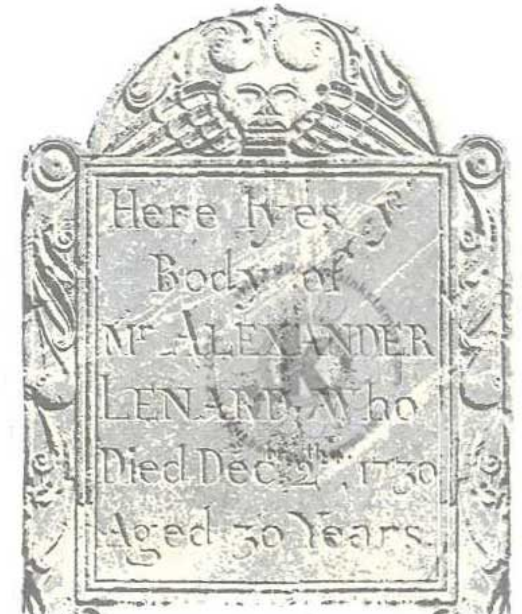
Step #1 - Desert Sand