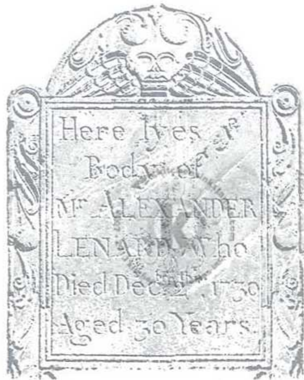
Step #1 - London Fog stamp off 1x