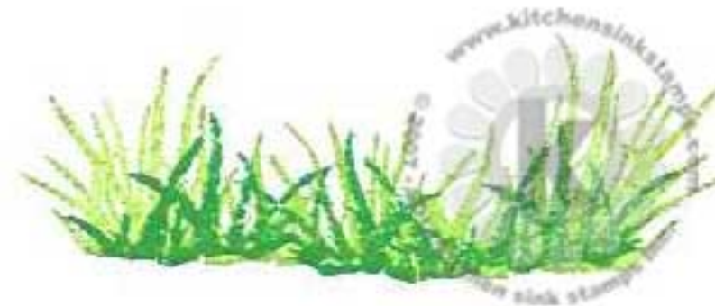
Step #1 - Lime Rickey