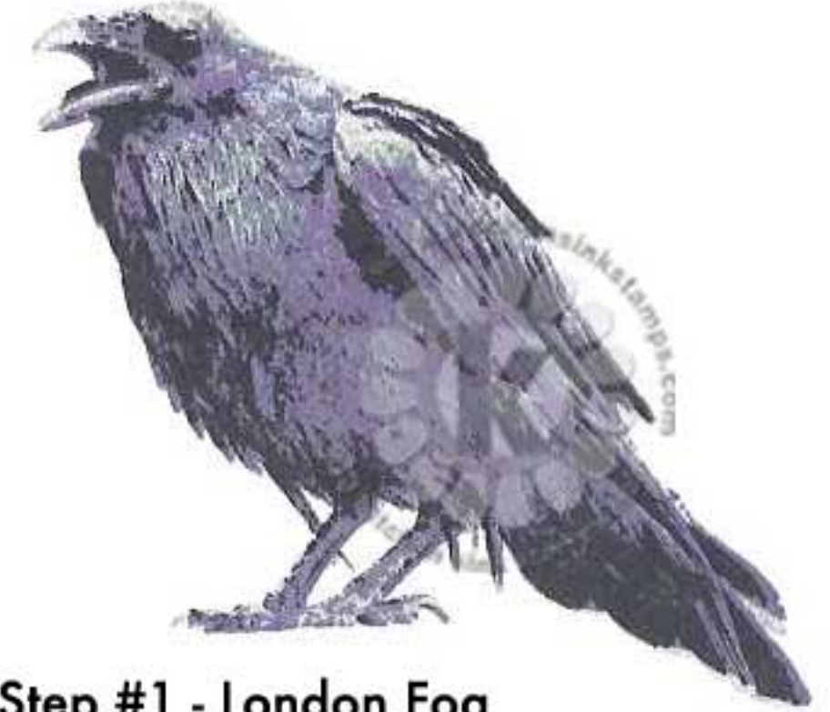
Step #1 - London Fog