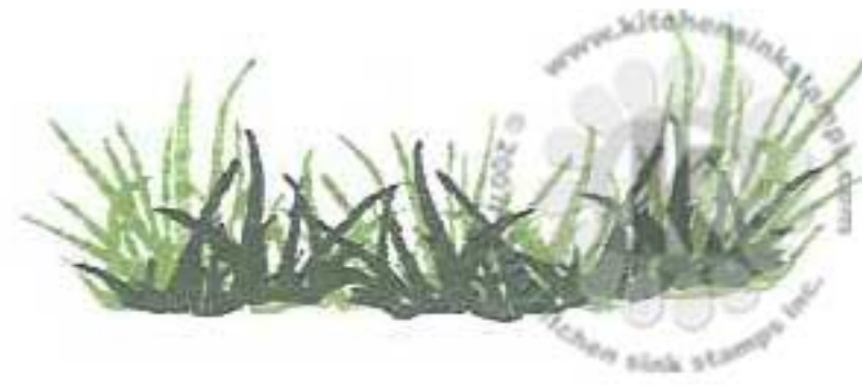
Step #1 - Bamboo Leaves