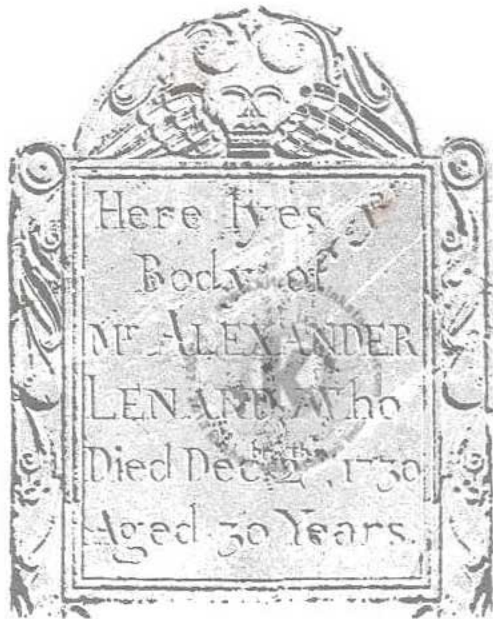
Step #1 - Sand Castle stamp off 1x