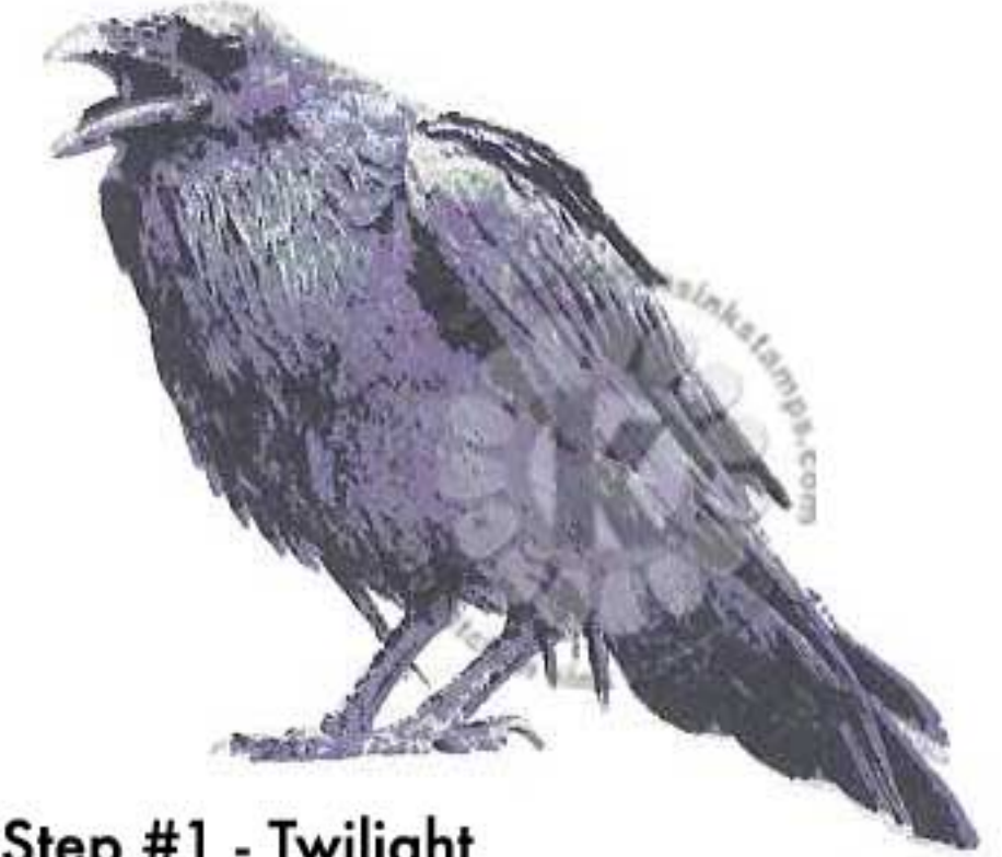
Step #1 - Twilight