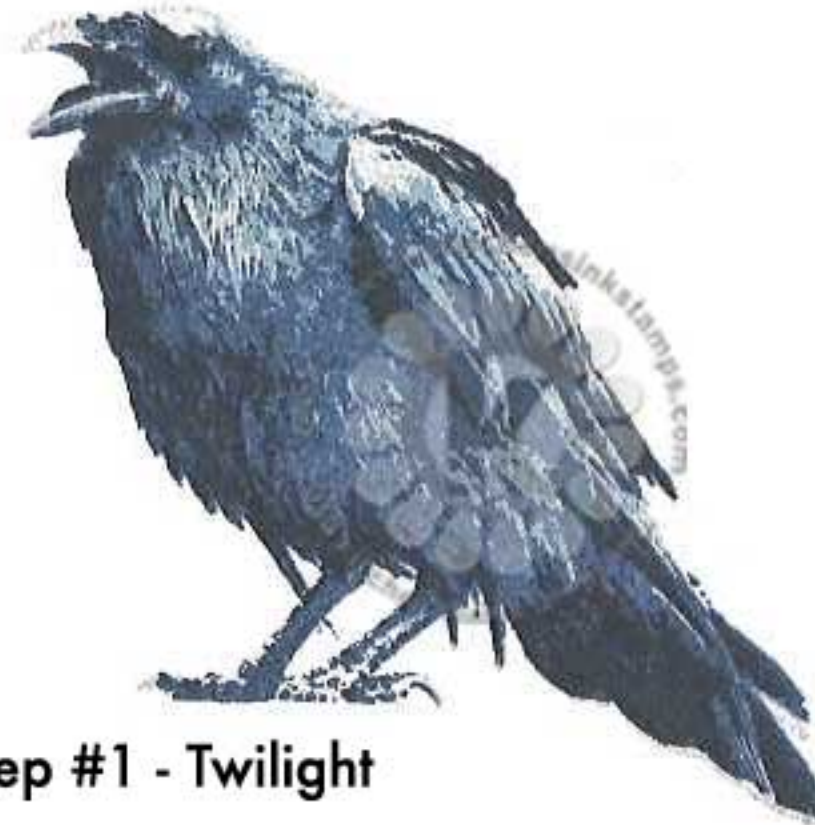
Step #1 - Twilight