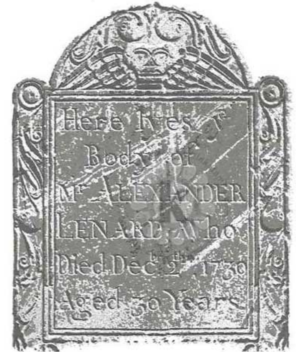
Step #1 - Twilight