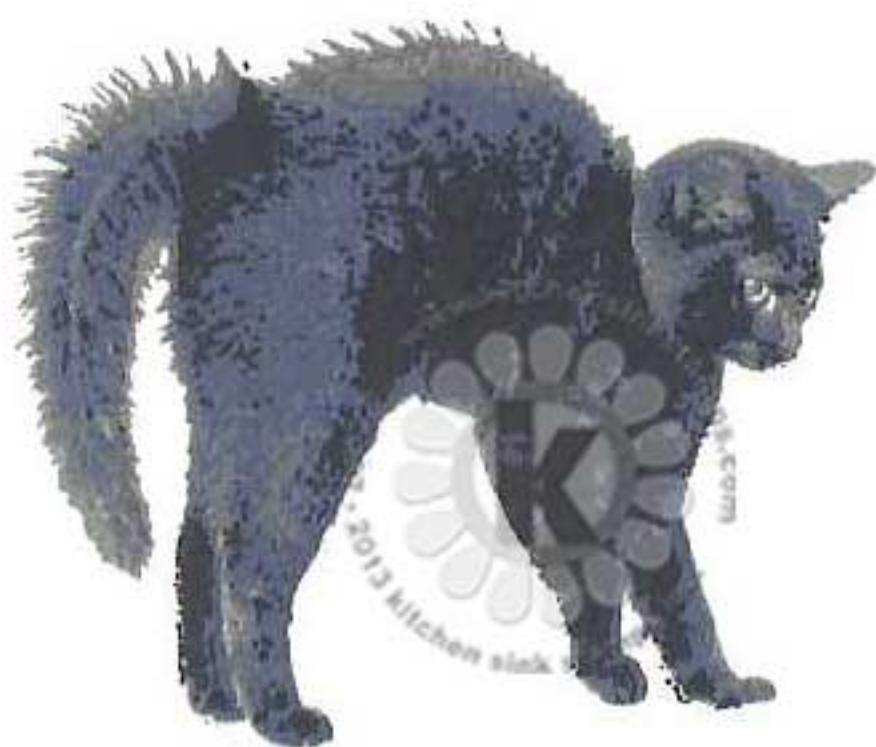
Step #1 - Morning Mist (VesraFine Clair)