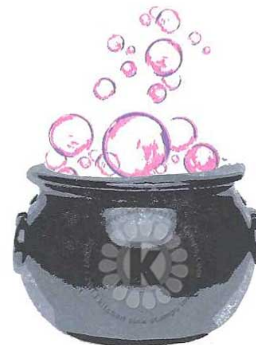
Step #1 - Gray Flannel