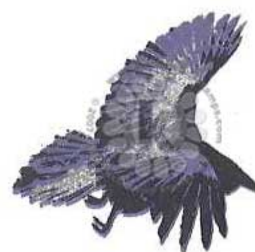
Step #1 - Morning Mist (VesraFine Clair)