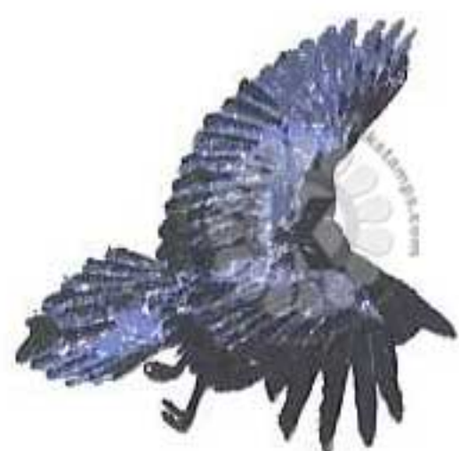
Step #1 - Paris Dusk