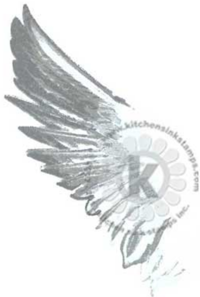
Step #1 - Summer Sky