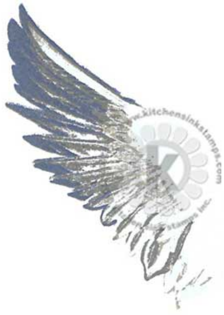
Step #1 - Summer Sky