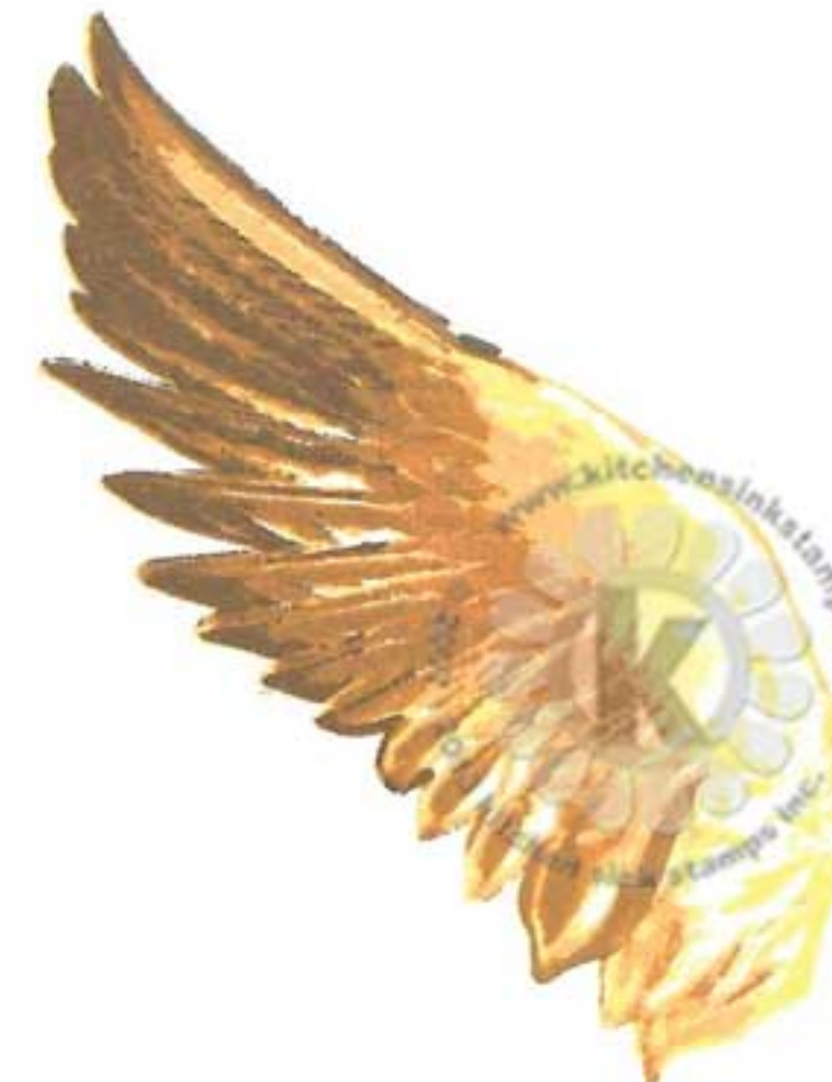
Step #1 - Dandelion