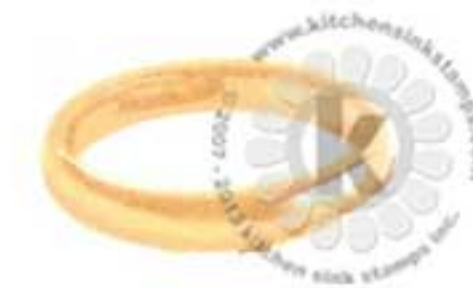
Step #3 - Peanut Brittle