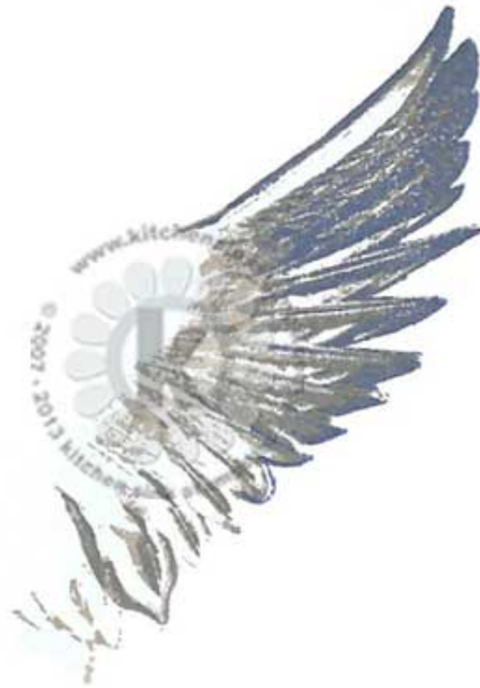
Step #2 - Summer Sky 2x's