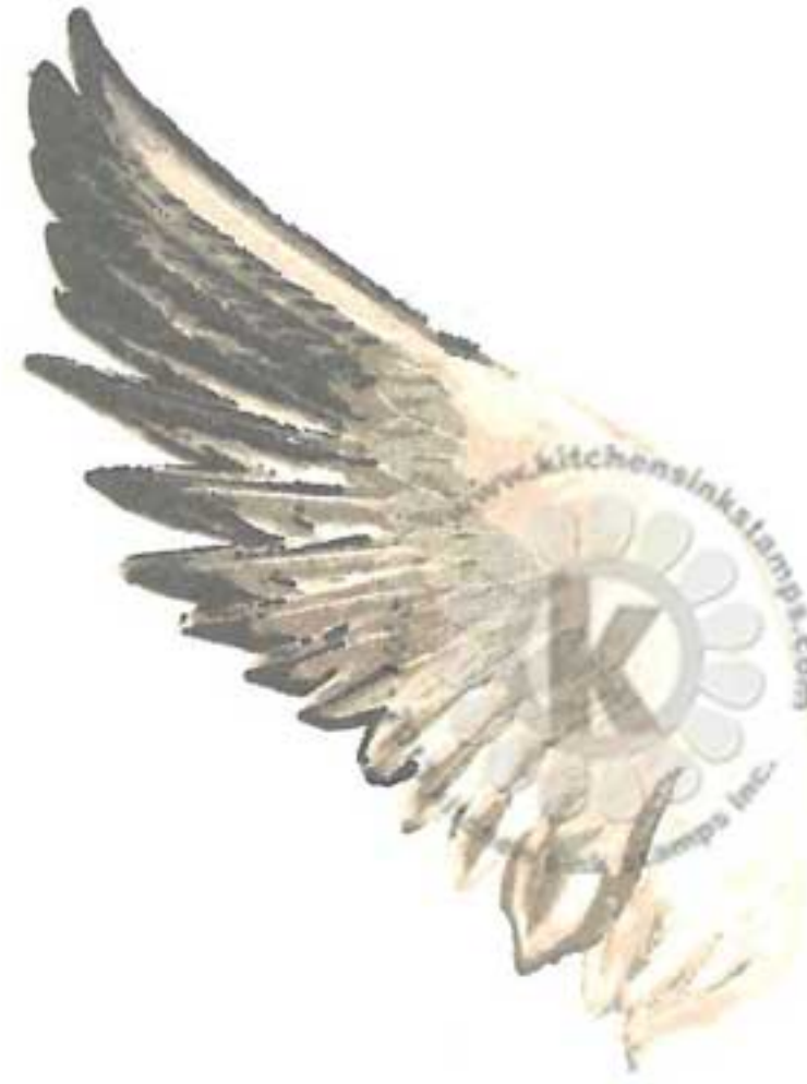
Step #1 - Desert Sand